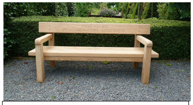
Chris Nangle – Green Oak back bench. 2m long colour - Natural