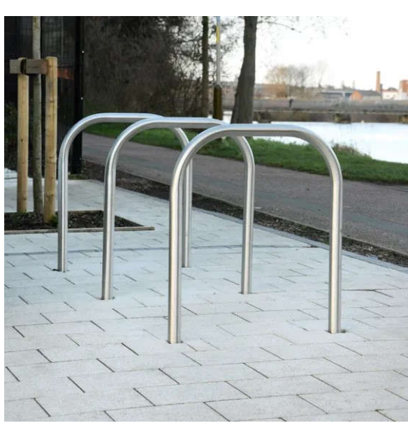
Sheffield stand Broxap BXMW/GS Stainless steel cycle stand root fixed.