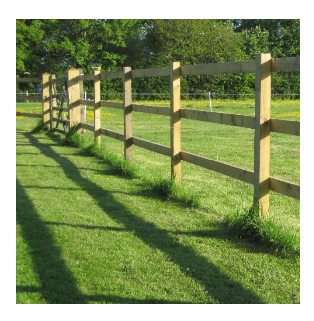
1100mm high timber post and 3 rail fencing. Softwood timber. Pressure impregnated. Colour natural