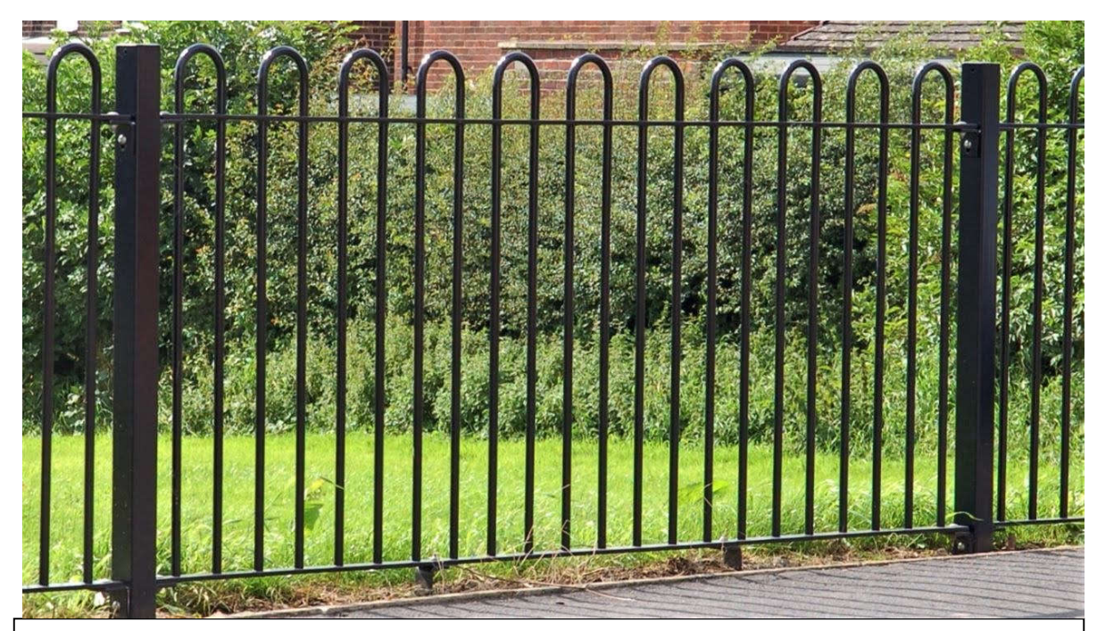
1200mm high hoop top railing along top of bank to brook. Colour Black RAL 9005. Where railing is required to top of retaining wall to be 1100mm high on top of wall with 100mm upstand.