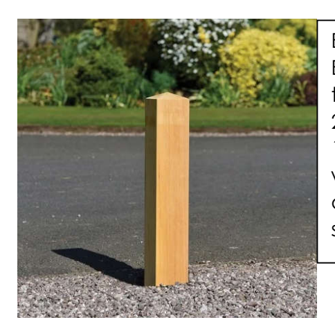
Bollard – Broxap BX17 pointed timber bollard 200mm square, 1200mm high with rebate and reflective strip