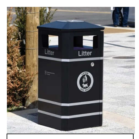
Broxap Derby Litter bin Colour Black RAL 9005

Specification in Abbey Fields Management Plan design guide: