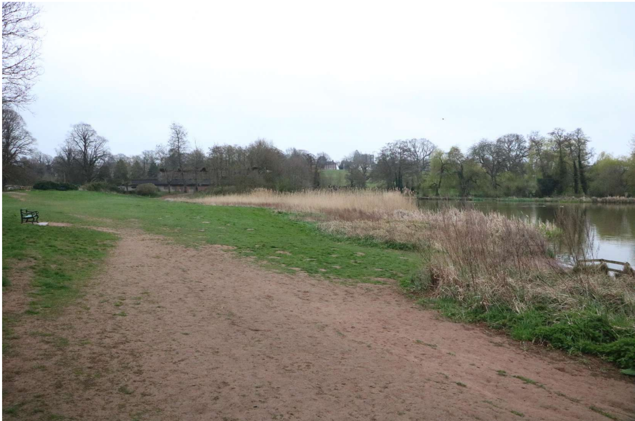
SECTION 73 APPLICATION