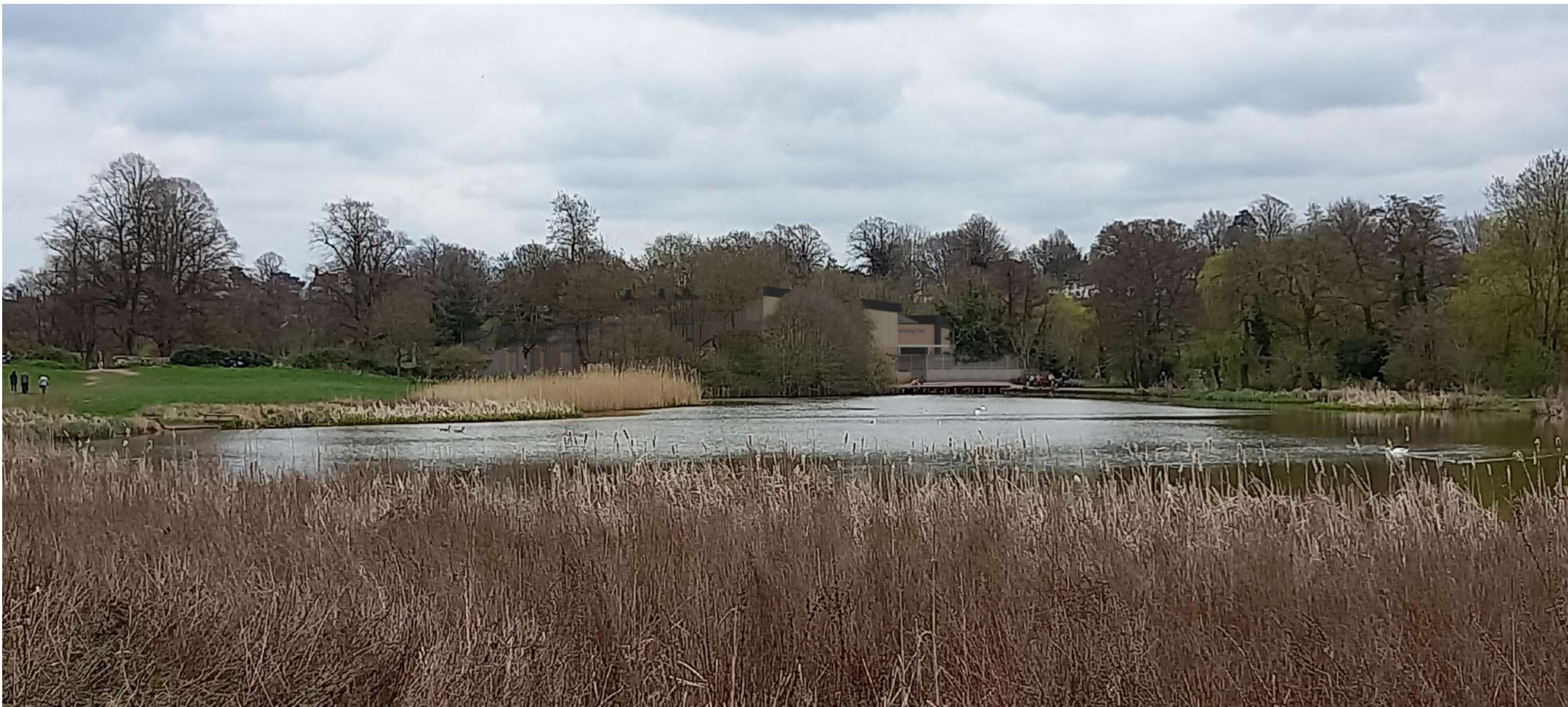
SECTION 73 APPLICATION