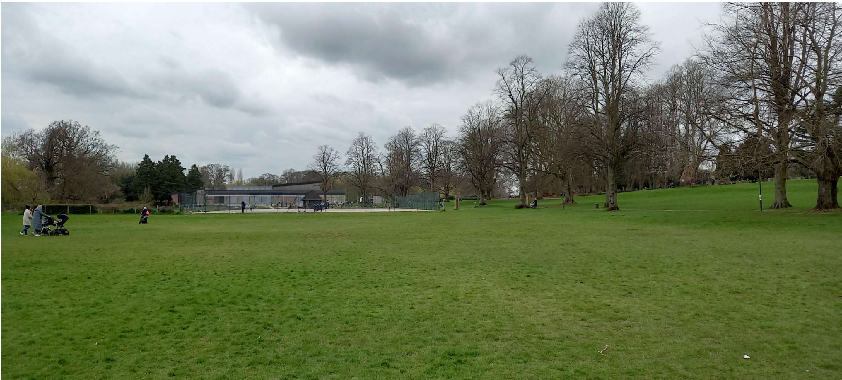
SECTION 73 APPLICATION