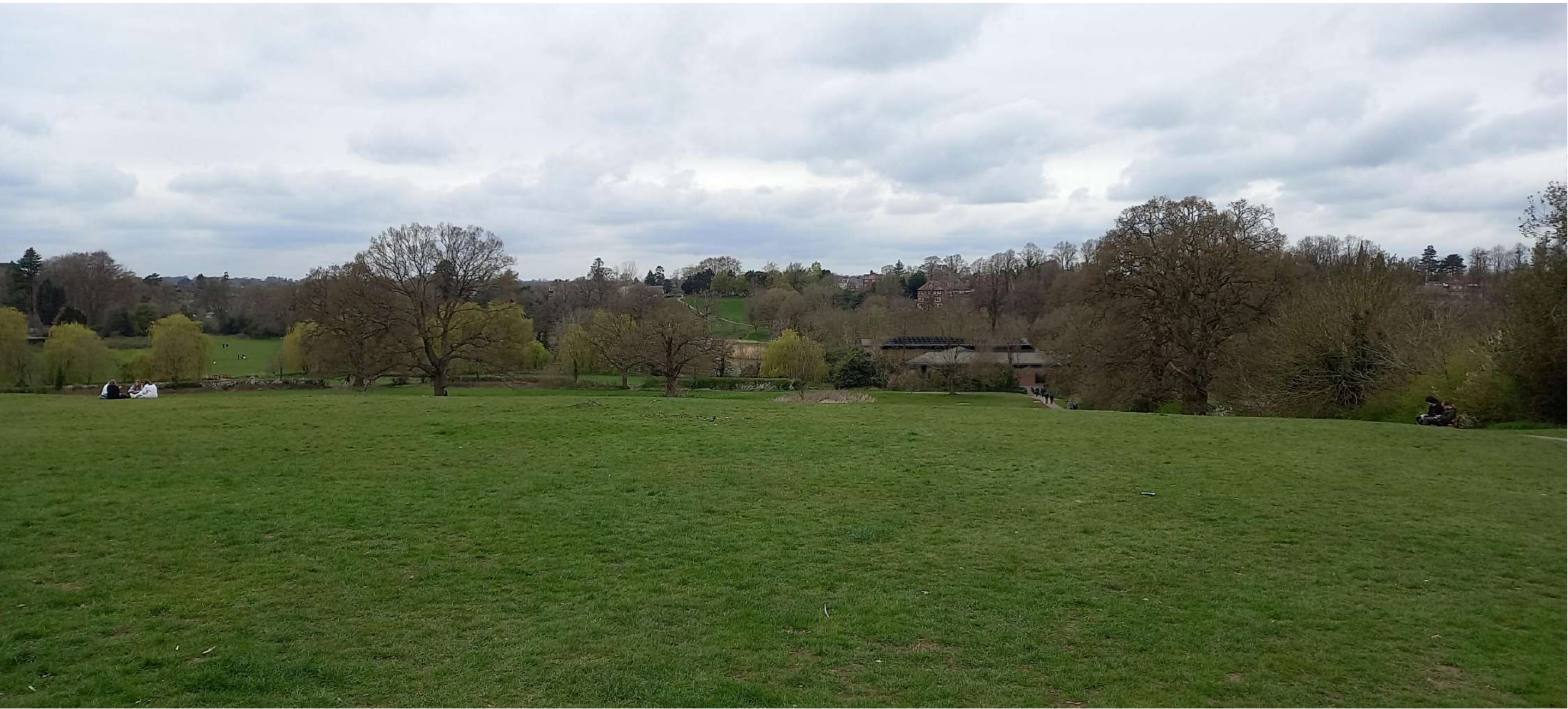
SECTION 73 APPLICATION