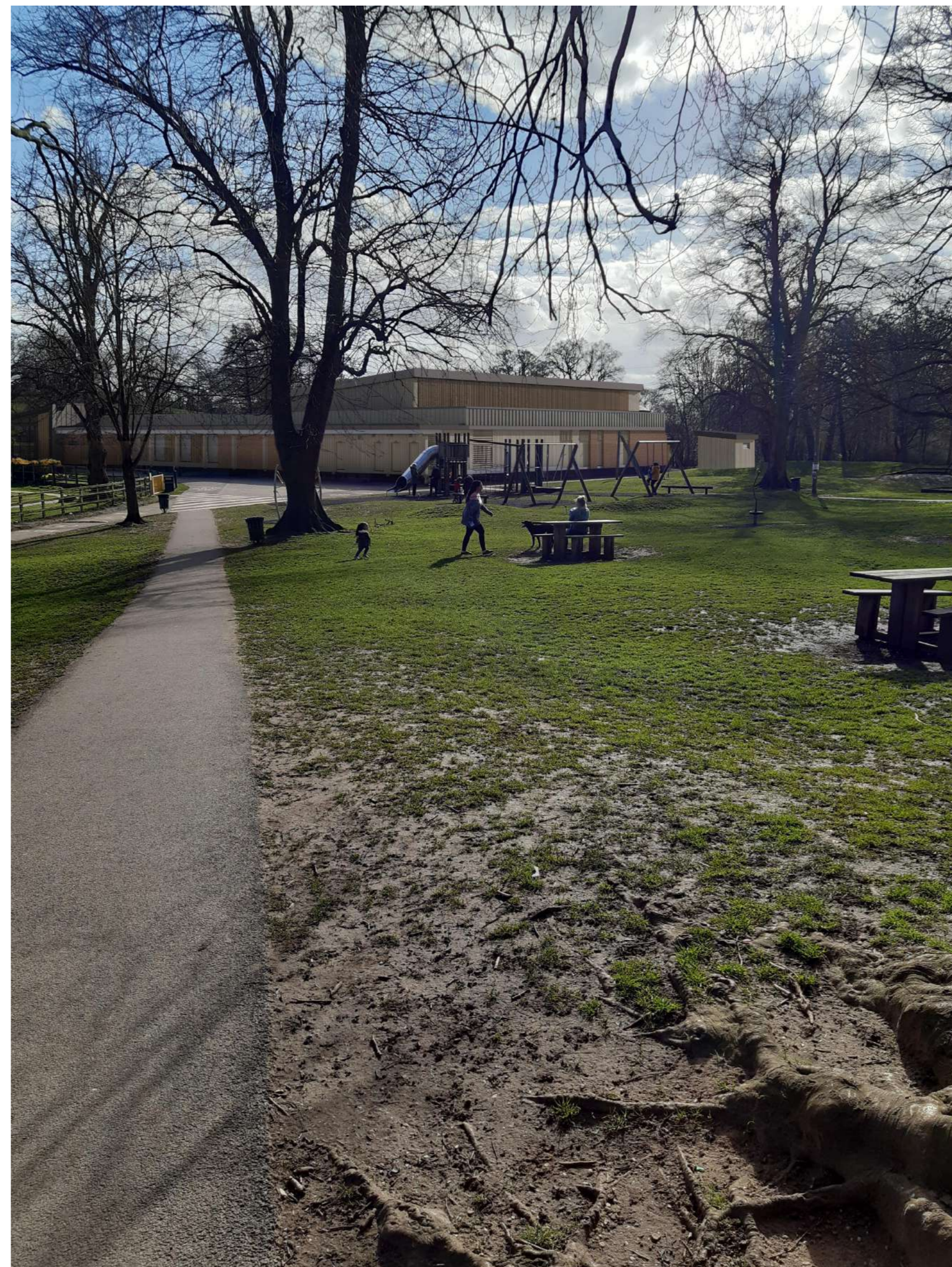
SECTION 73 APPLICATION