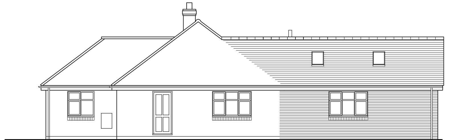
WEST ELEVATION (S)