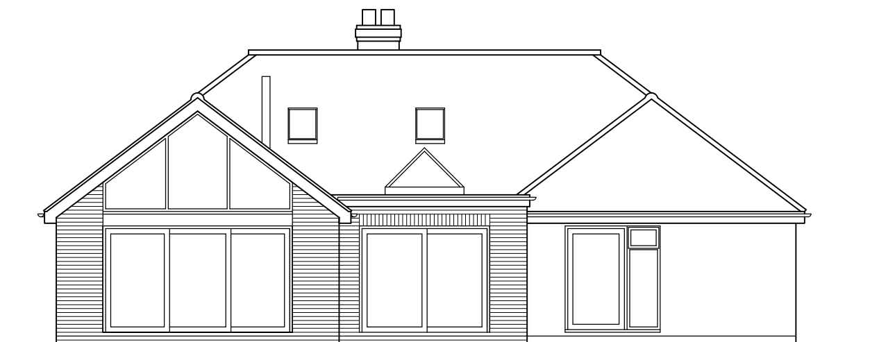
SOUTH ELEVATION (R)