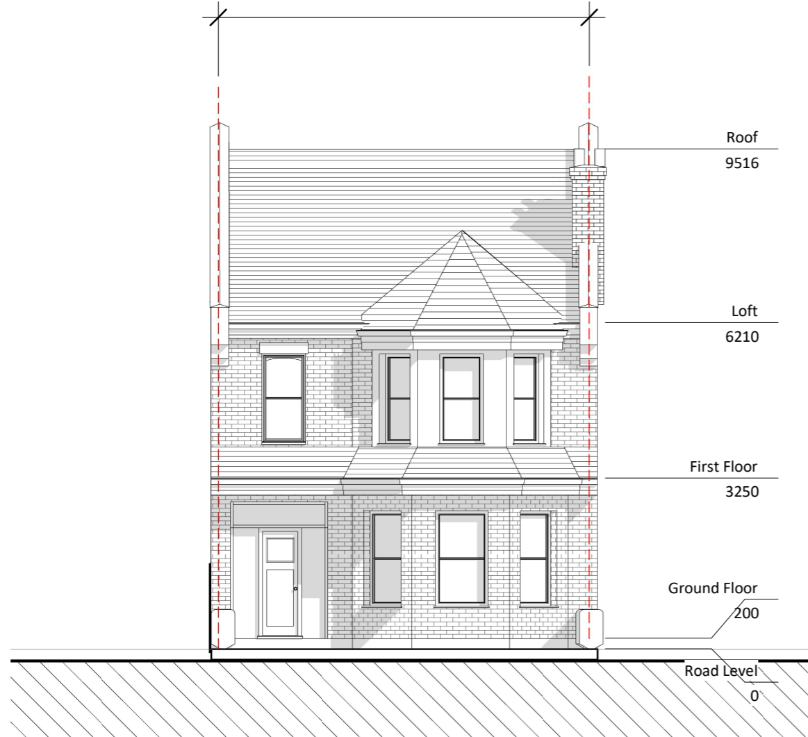
1 Front 1 : 100