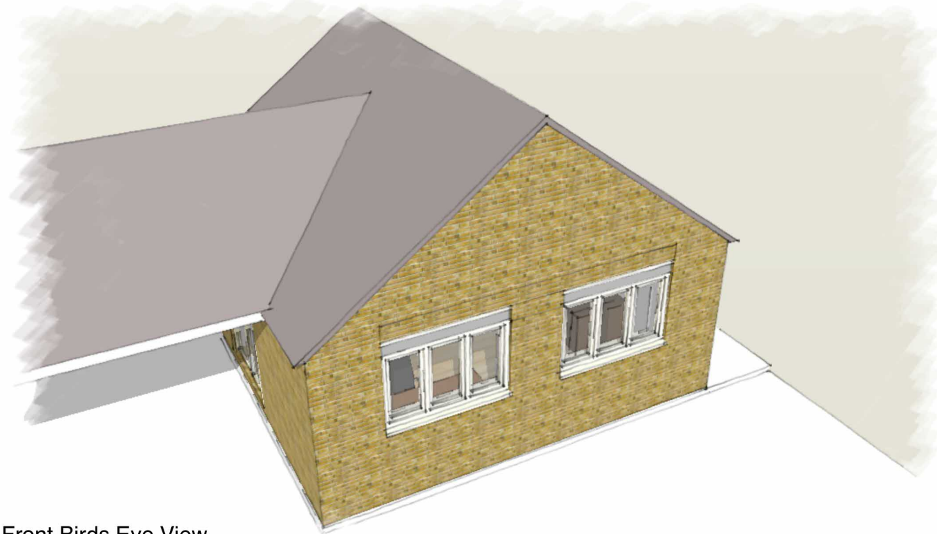
Front Birds Eye View