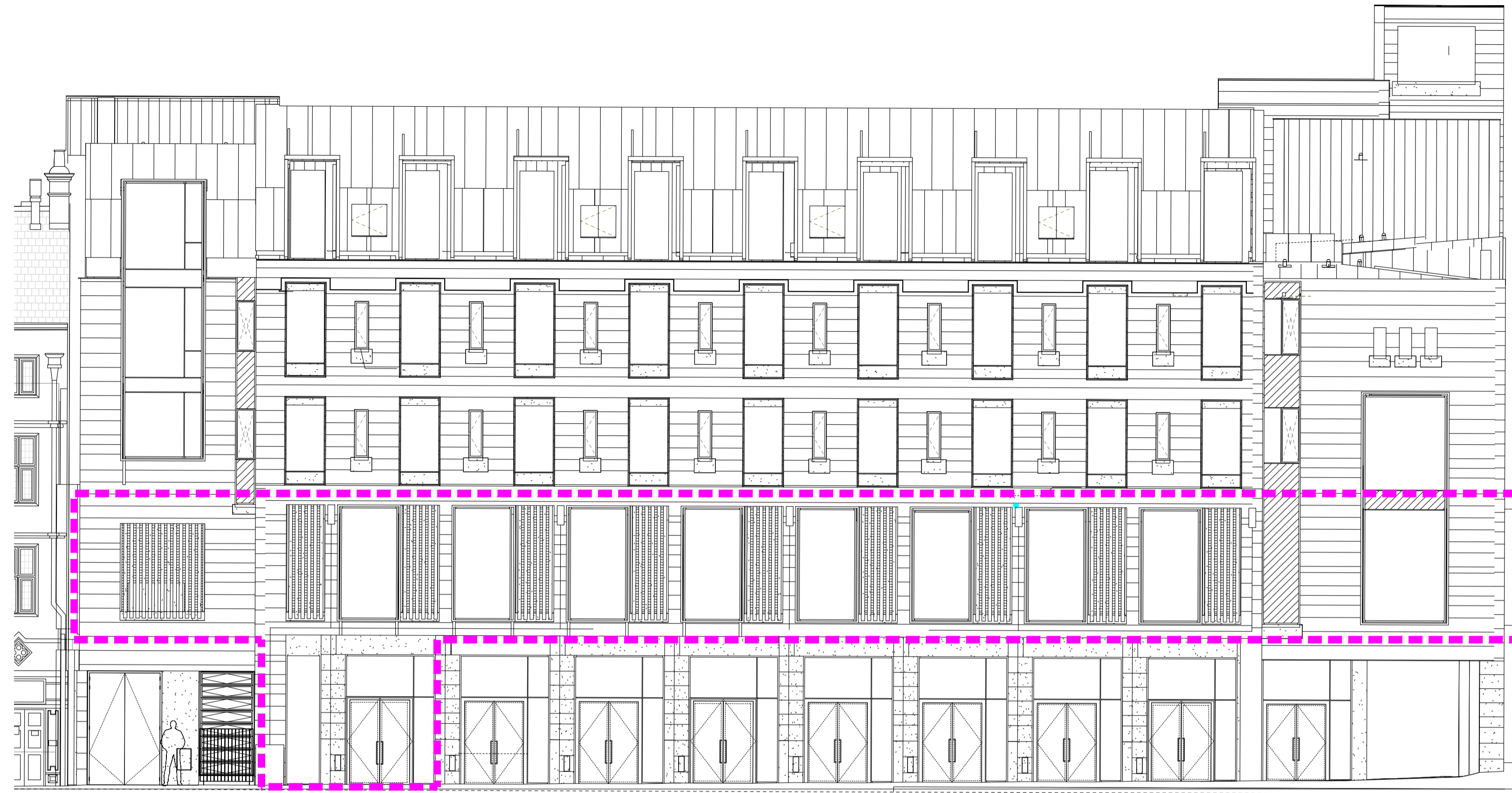
Existing part West elevation