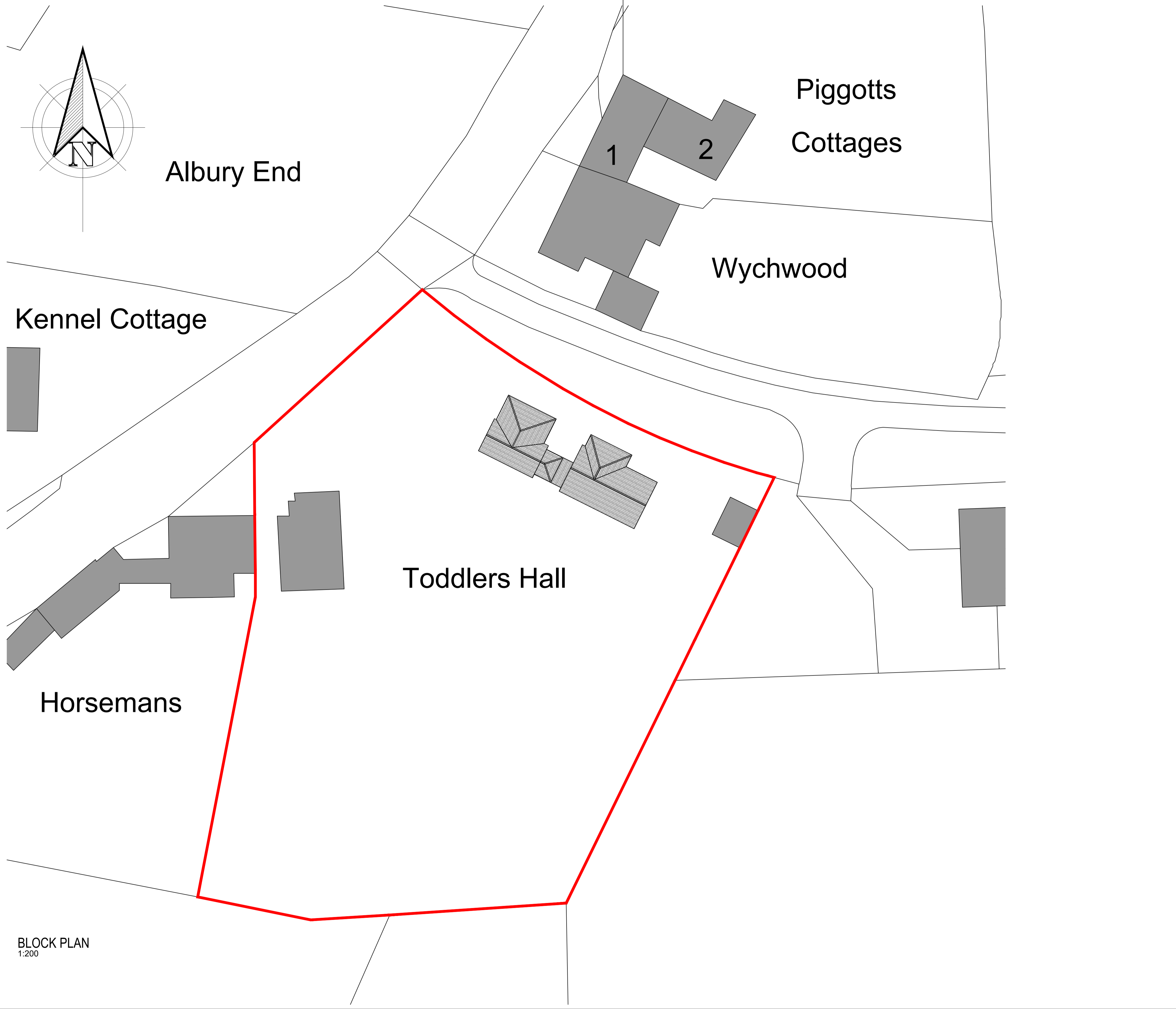
BLOCK PLAN 1:200