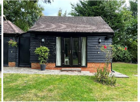
Lounge SW façade