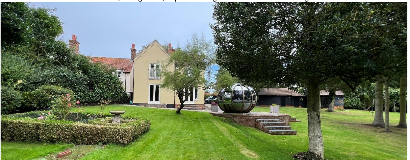
Horseman's, Toddlers Hall, garden & outbuilding to east