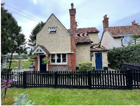
Toddlers Hall north (front) façade