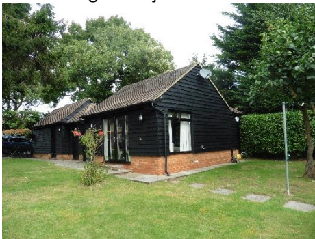
Outbuilding south corner