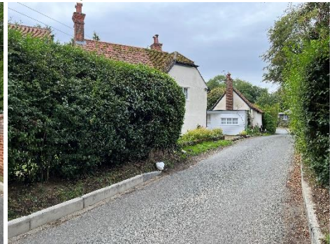
Horseman's & outbuilding looking SW