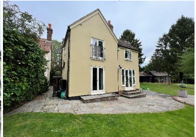
SW corner of Toddlers Hall & Outbuilding