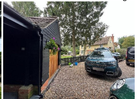
Outbuilding NW façade & Toddlers Hall