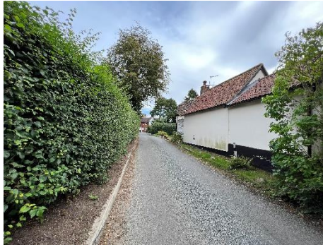
Horseman's Outbuilding looking NE