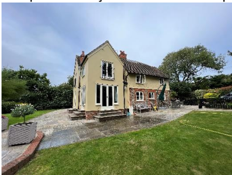
SE corner of Toddlers Hall