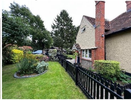
Front garden, outbuilding & Toddlers Hall