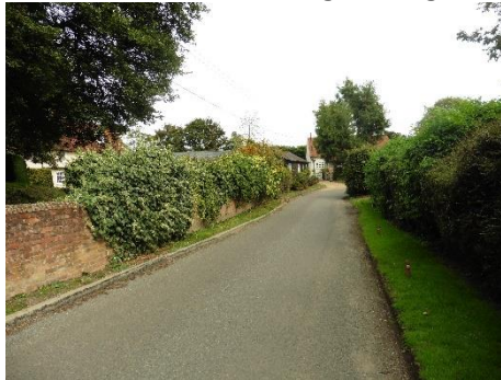
Looking north towards Kennel Farmhouse, Outbuilding & Kennel Cottage