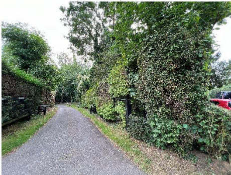
FP, NE Lane & NE boundary hedge