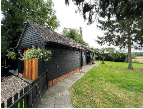
West corner of Outbuilding