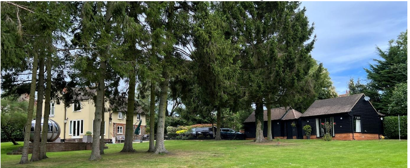
Toddlers Hall, rear garden, copse of evergreen trees and outbuilding to east