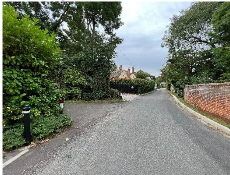
Toddlers Hall & PF Boundary Wall