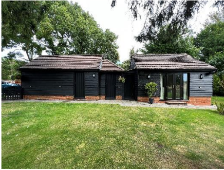
Outbuilding SW façade