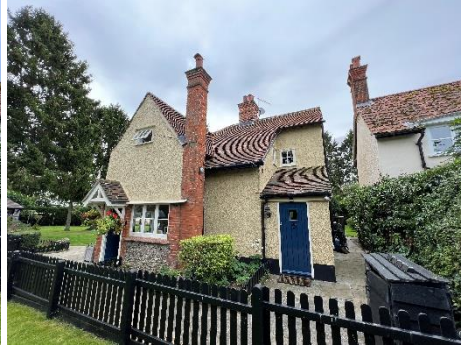
NW corner of Toddlers Hall