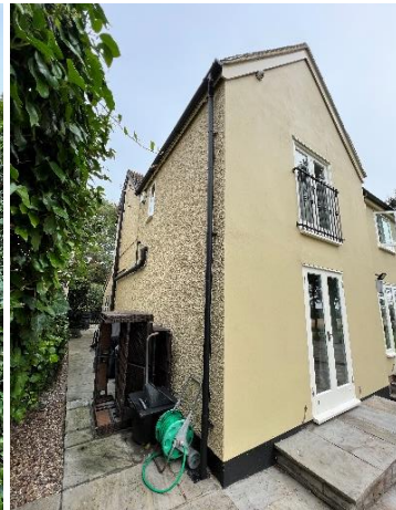
Glimpse of W façade from S