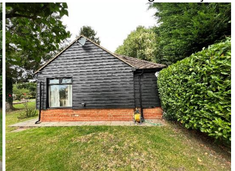
Outbuilding SE façade