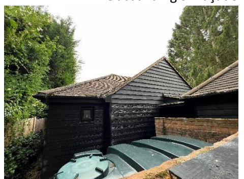
NW façade of lounge & toilet