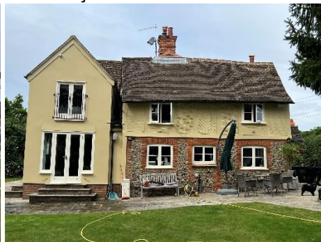
Toddlers Hall east façade