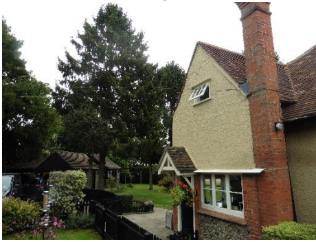
Outbuilding & Toddlers Hall front