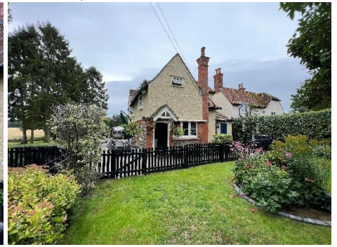
NE corner of Toddlers Hall