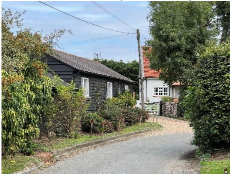
Outbuildings East of Kennel Farmhouse