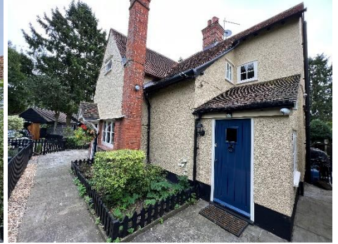
Outbuilding & NW of Toddlers Hall