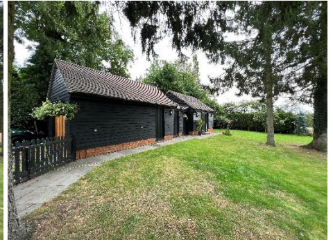
Outbuilding SW façade from west