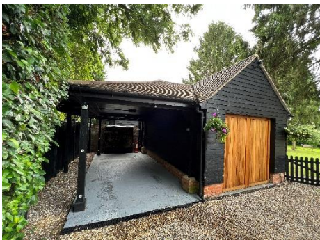
Outbuilding - carport & garage from N