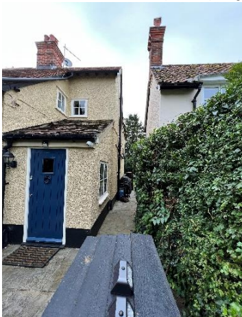
Glimpse of W façade from N