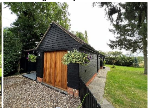
West corner of Outbuilding