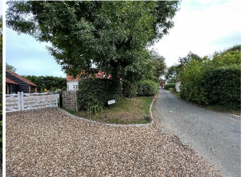
Kennel Cottage access & lane