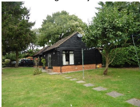
South of Outbuilding