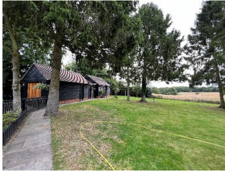
Outbuilding from SW