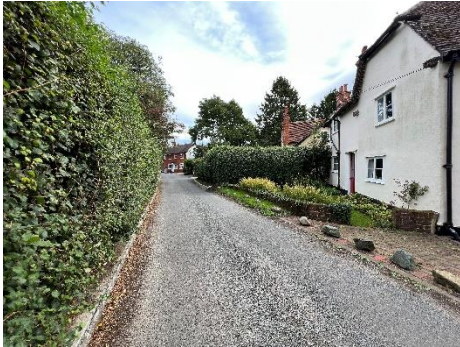
Horseman's front façade looking NE