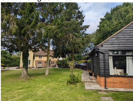
Toddlers Hall & S corner of outbuilding