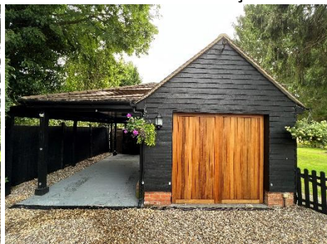
Outbuilding - Carport & garage NW façade