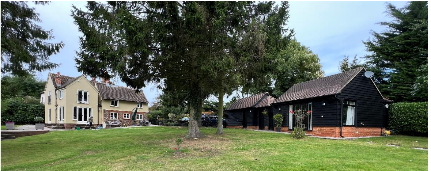
Toddlers Hall, rear garden and outbuilding to east