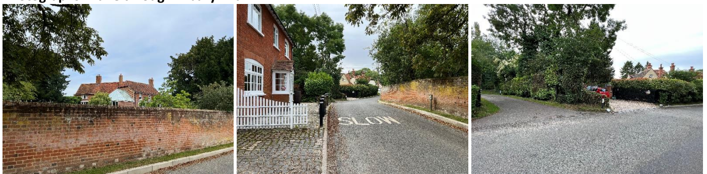
Piggotts Farmhouse & Boundary Wall View to Toddlers Hall & PF Boundary Wall FP, NE lane & Toddlers Hall access