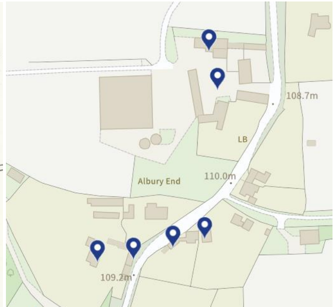
Historic England Listing Map

The 1892 to 1914 OS map shows a lane in the same approximate location of the modern lane with a similar bend. There are numerous buildings which share the same approximate locations around Albury End. There is a road fronting building shown and a range to its east; the east most of this range is in the approximate location of Toddlers Hall.