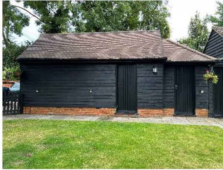
Garage SW façade