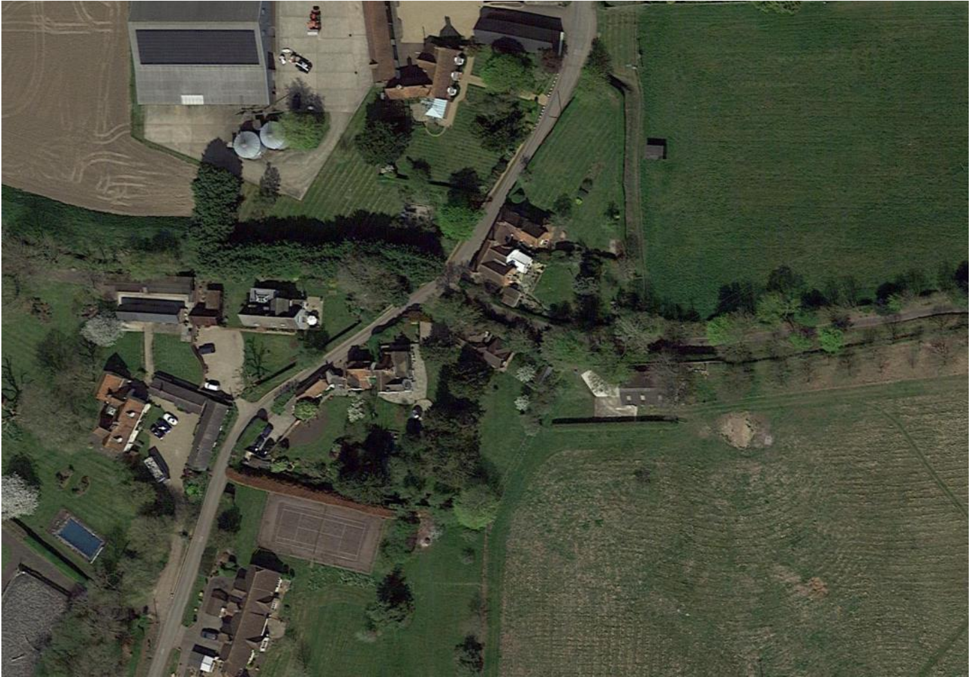
Google Earth Satellite Image