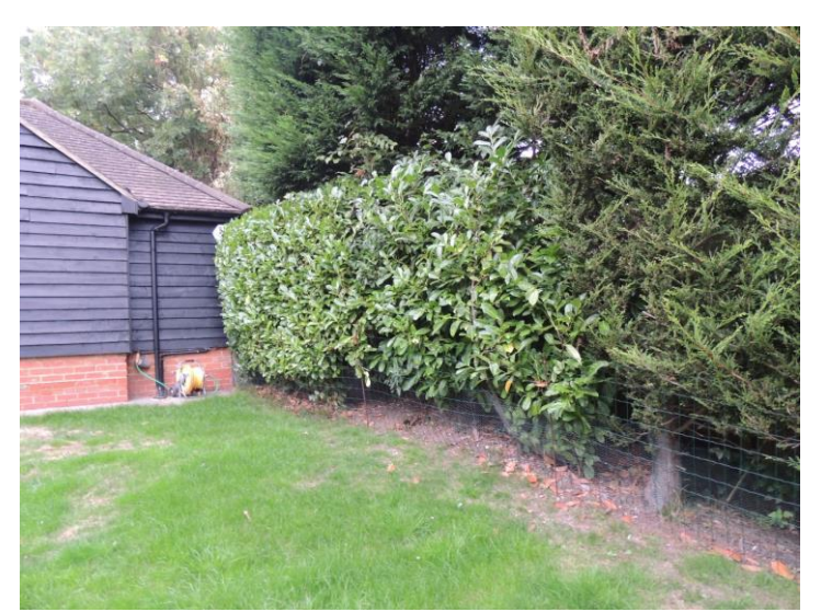
Photo 13: The Laurel hedge along the NE boundary is unaffected by the project