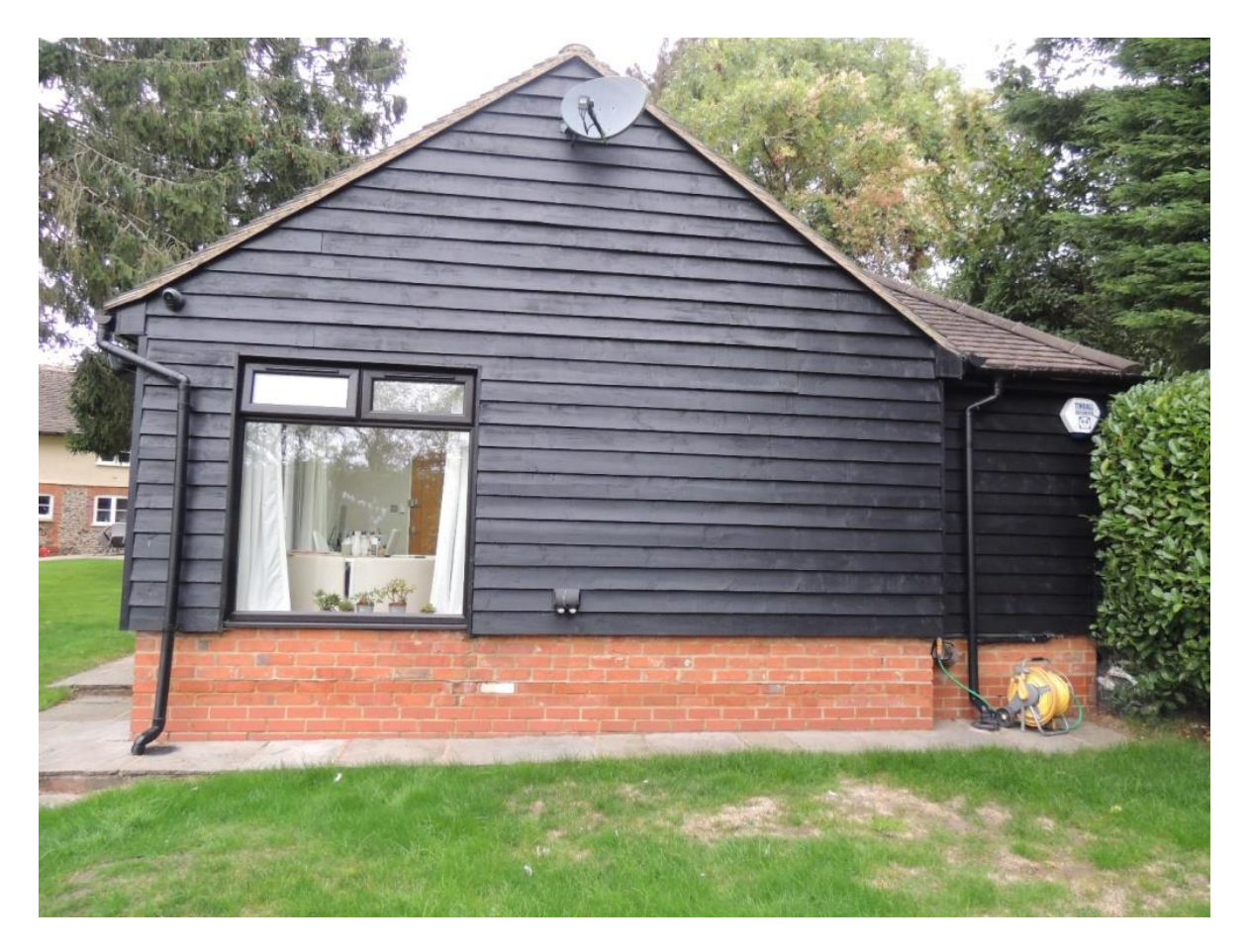
Photo 1: South-eastern elevation. The proposal is to extend this side of the building

As part of a planning proposal to extend an annexe at Toddlers Hall, Albury End, Albury, Ware, Hertfordshire SG11 2HS, a site visit was conducted on 11<sup>th</sup> October 2023 to determine whether the site had the potential to be occupied by protected species, which would be affected if any proposed development were to go ahead.