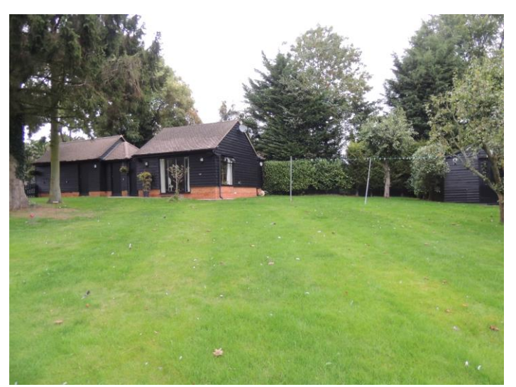
Photo 18: Looking towards the site. Note lack of habitat for reptiles