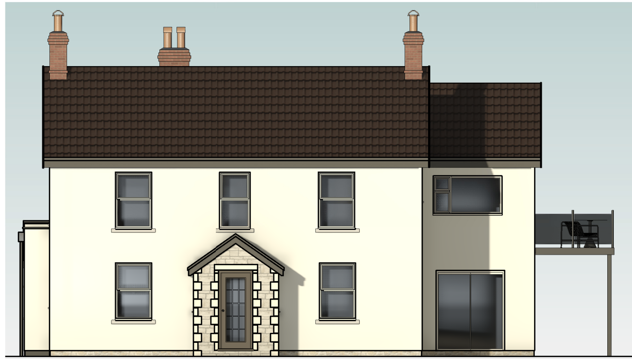
Proposed Front Elevation 1 : 100