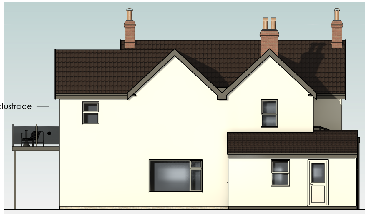
Proposed Rear Elevation 1 : 100