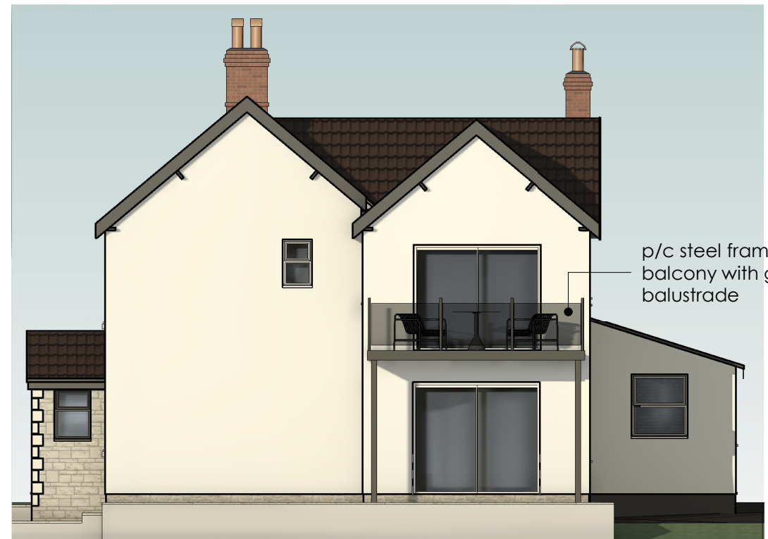
Proposed Side Elevation 1 1 : 100