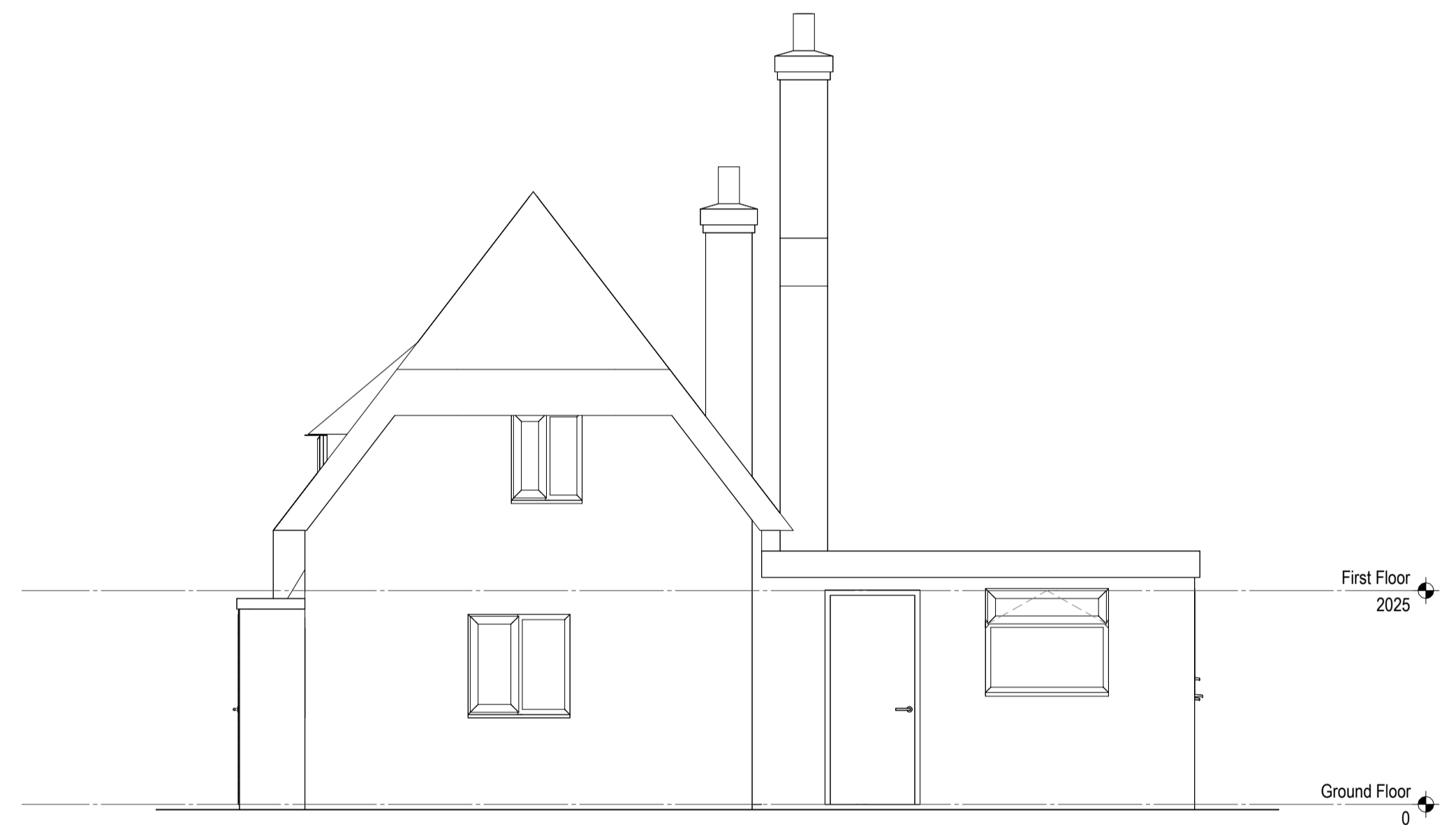
4 Existing Side (2) Elevation 1:50