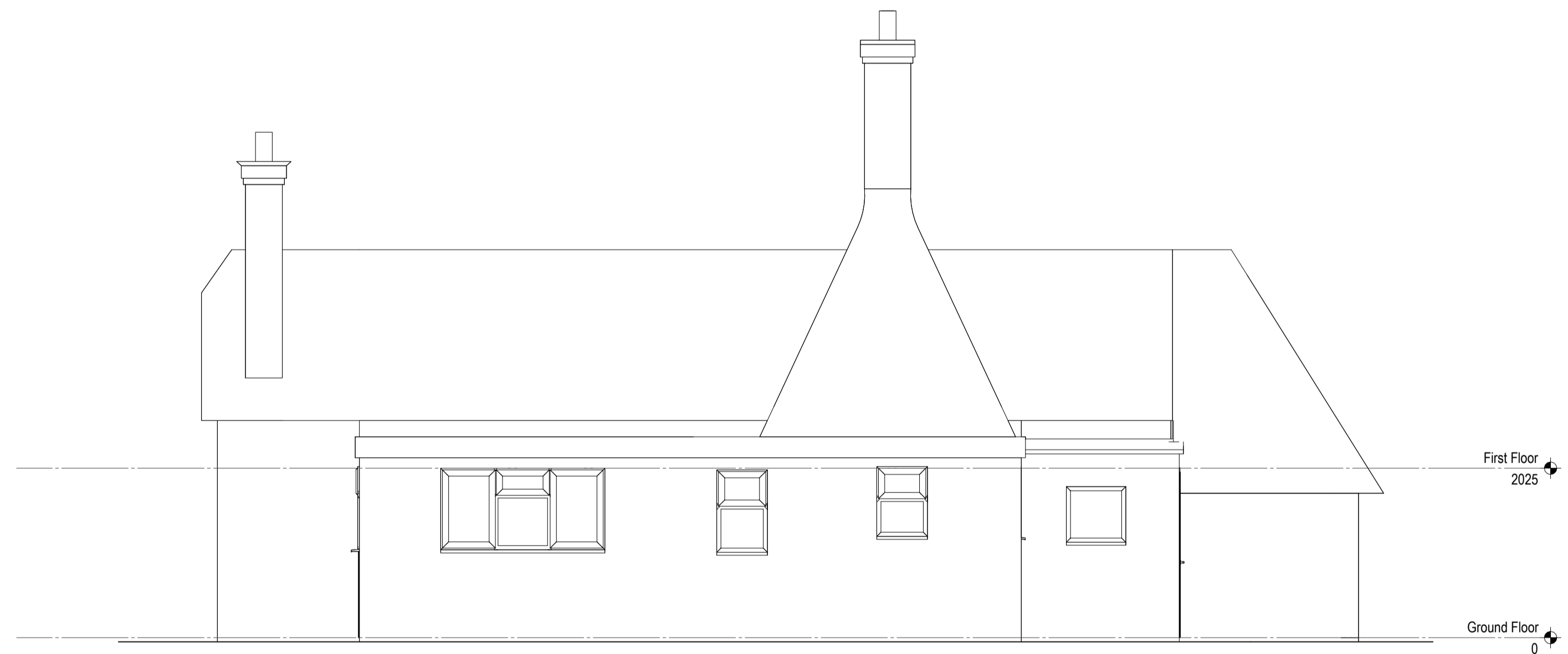
3 Existing Rear Elevation 1:50