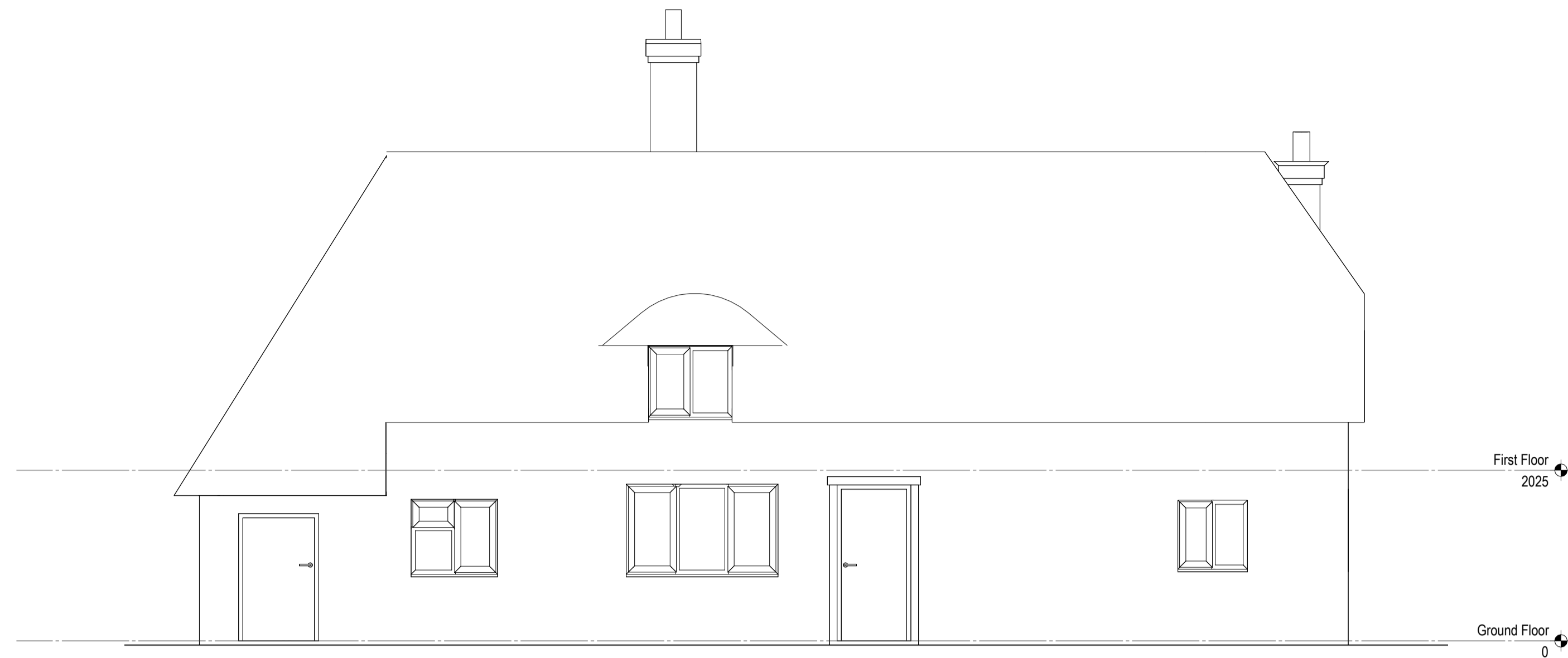
1 Existing Front Elevation 1:50