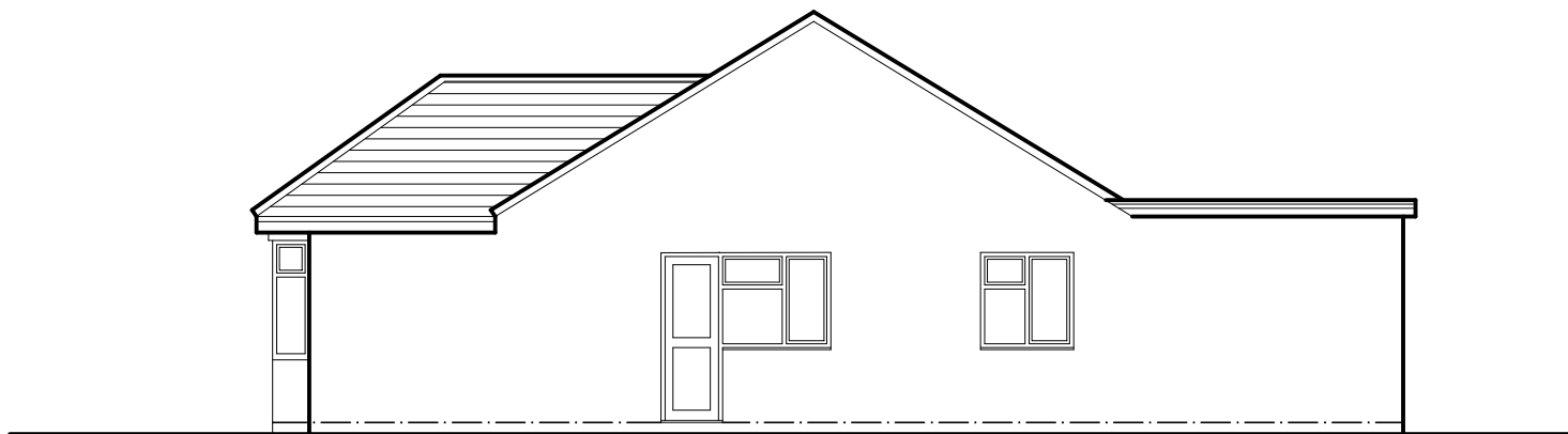
existing side elevation