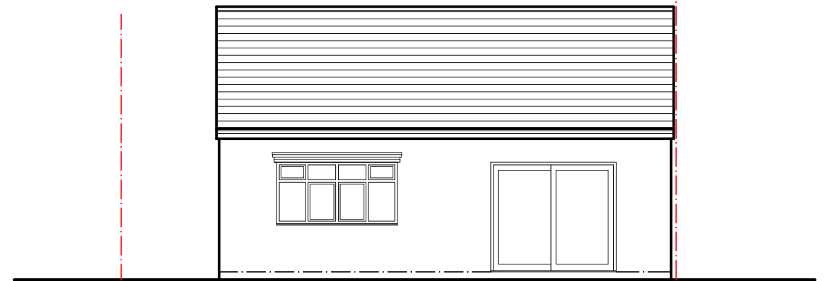
existing rear elevation