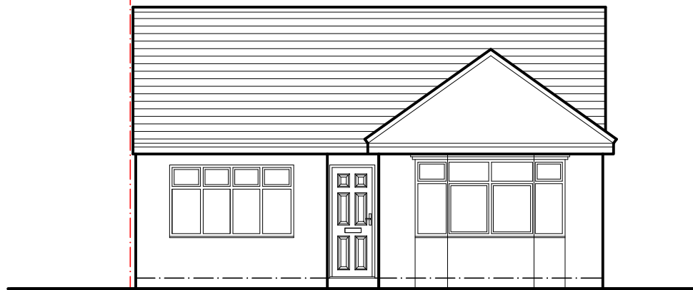
existing front elevation