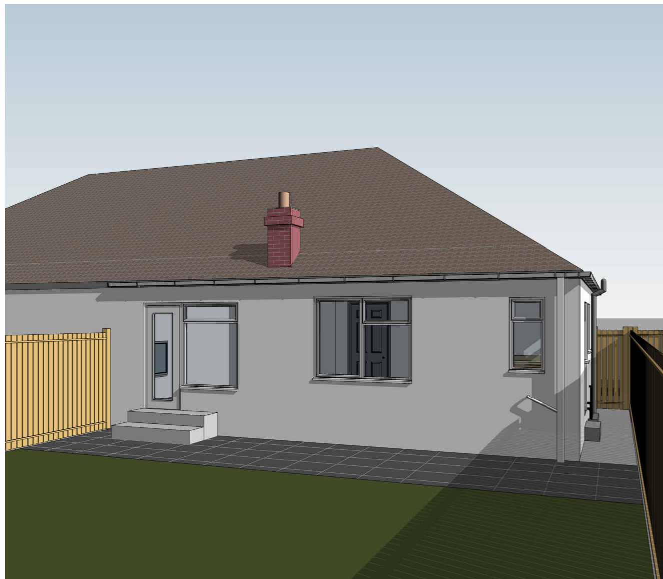
INDICATIVE 3D VIEW - REAR EXISTING