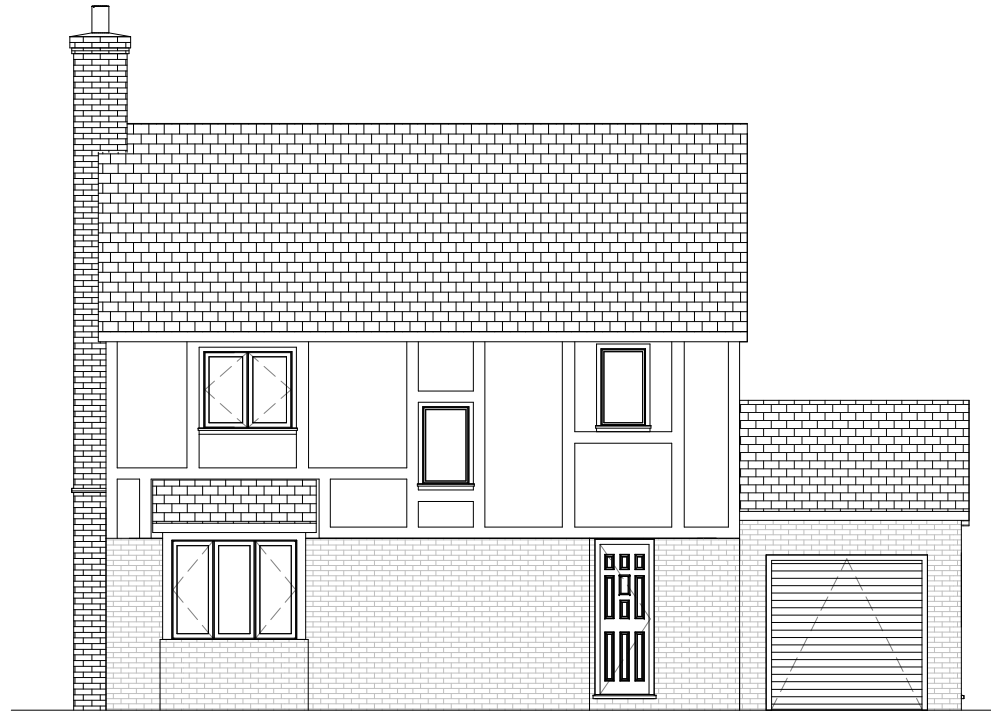
04/201 - EXISTING FRONT ELEVATION 1: 100

NOTE: All measurements to be checked on site. This drawing is prepared for planning purposes only.