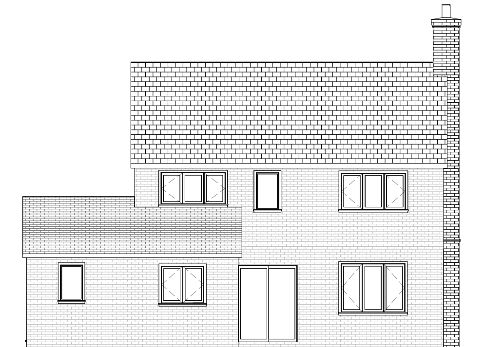
04/203 - EXISTING REAR ELEVATION 1: 100