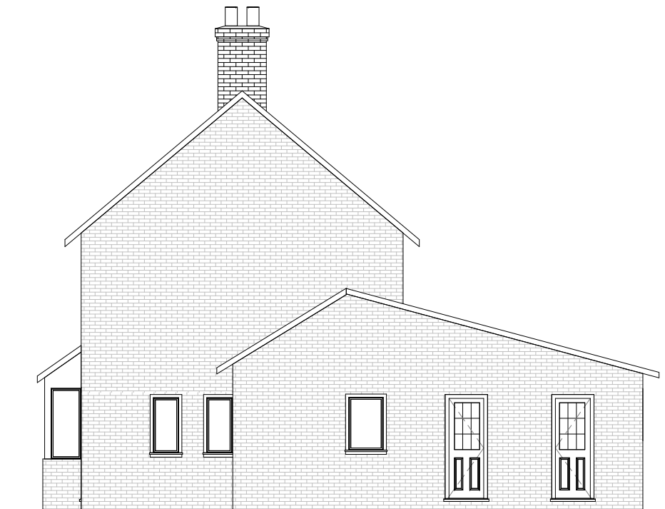
04/204 - EXISTING RIGHT ELEVATION 1: 100