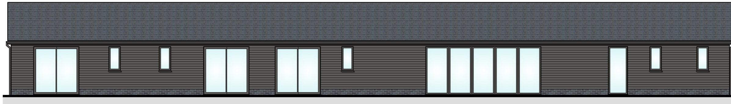
FRONT ELEVATION - 1:100