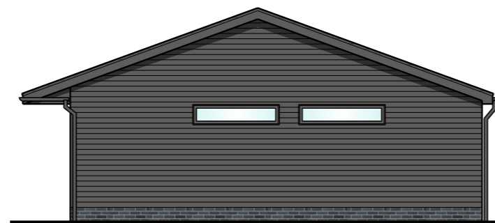
SIDE ELEVATION - 1:100