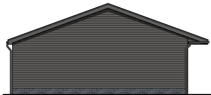
SIDE ELEVATION - 1:100