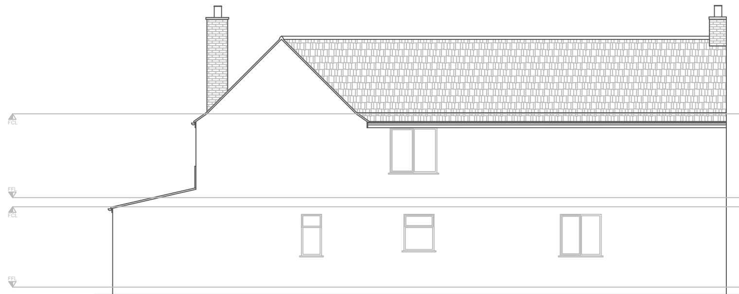
Rear (South East) Elevation