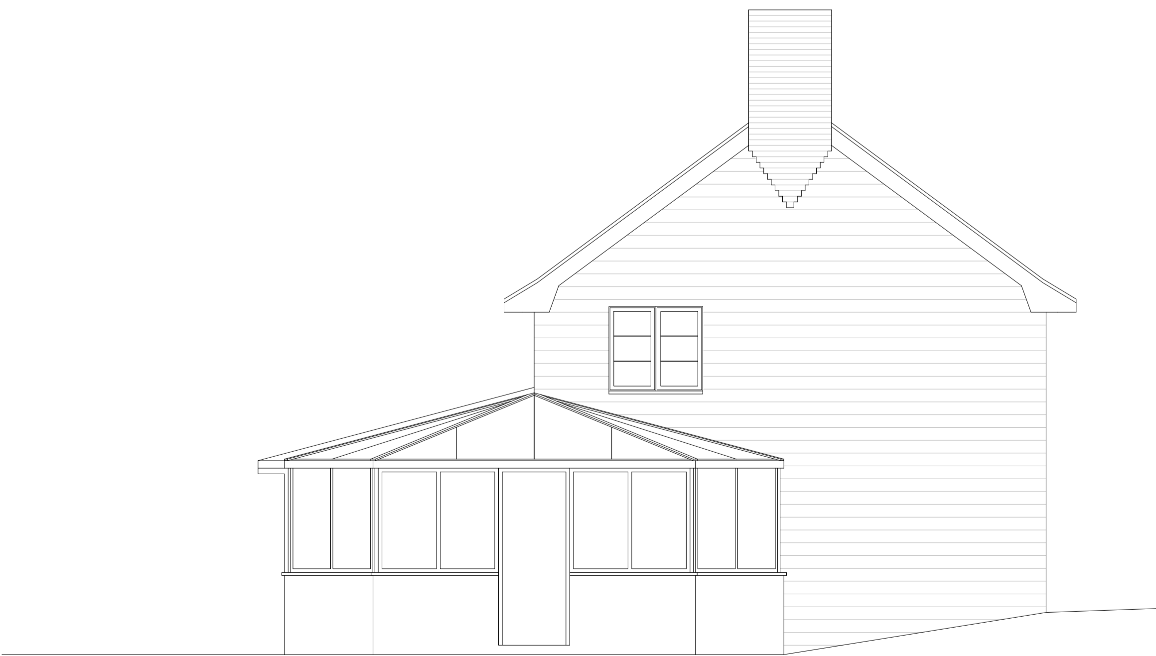
SIDE ELEVATION (WEST)

G 16.10.23 Updated to client comments Rev. Date Notes