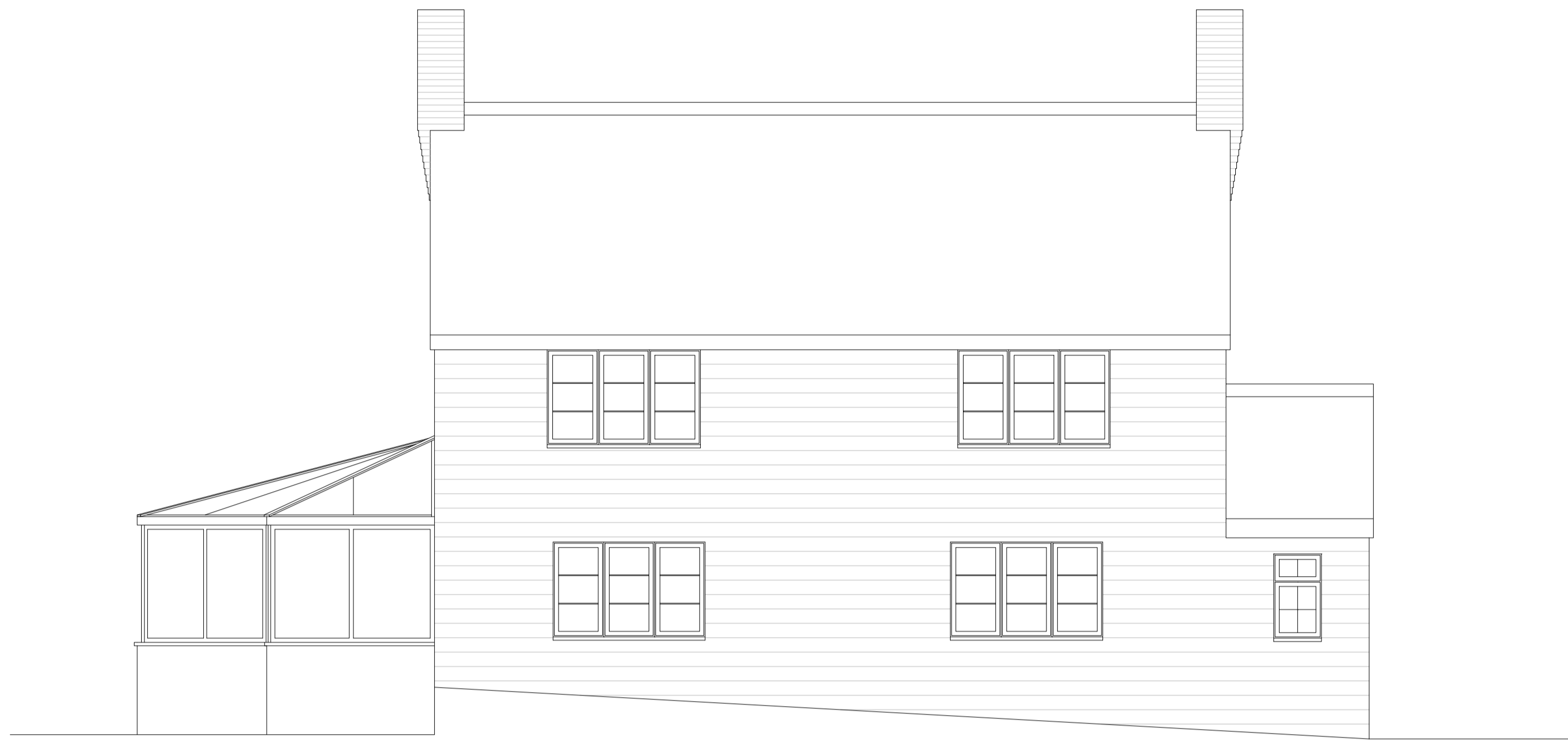
FRONT ELEVATION (SOUTH)

NOTES: ALL DIMENSIONS, LEVELS AND CLEARANCES TO BE CHECKED ON SITE PRIOR TO WORKS COMMENCING THIS DRAWING SHOULD BE READ IN CONJUNCTION WITH ALL OTHER PROJECT RELATED DRAWINGS, SPECIFICATIONS AND DOCUMENTS. THIS DRAWING IS COPYRIGHT OF GEBHARD AND GOODWIN