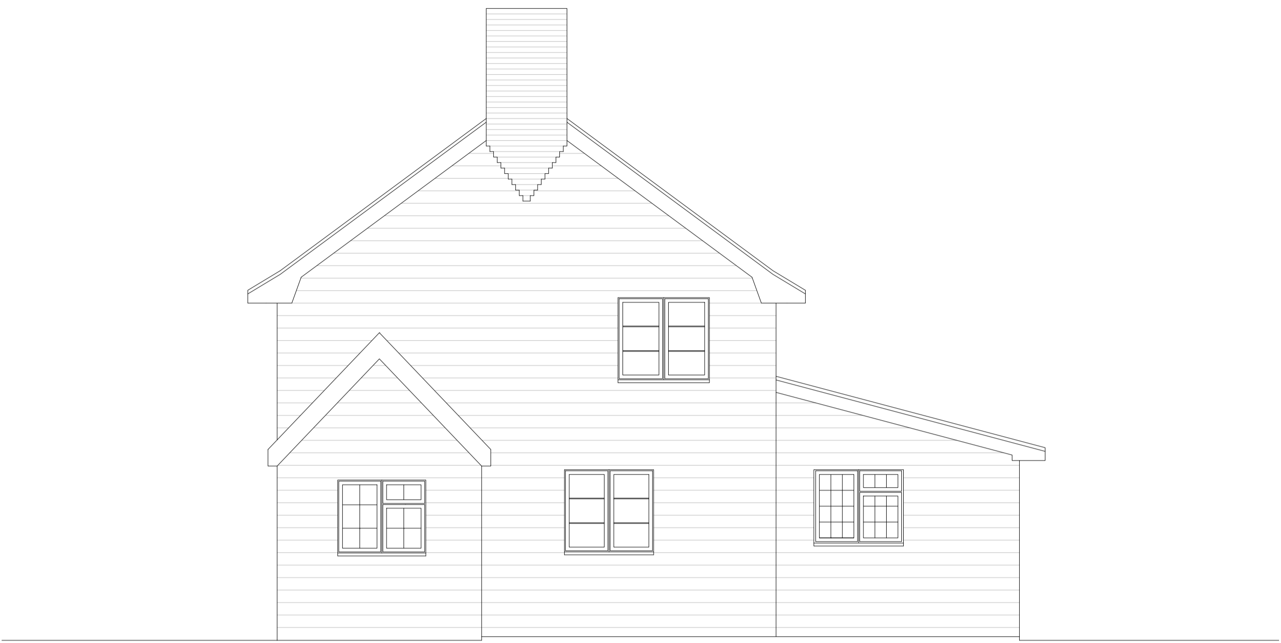
SIDE ELEVATION (EAST)