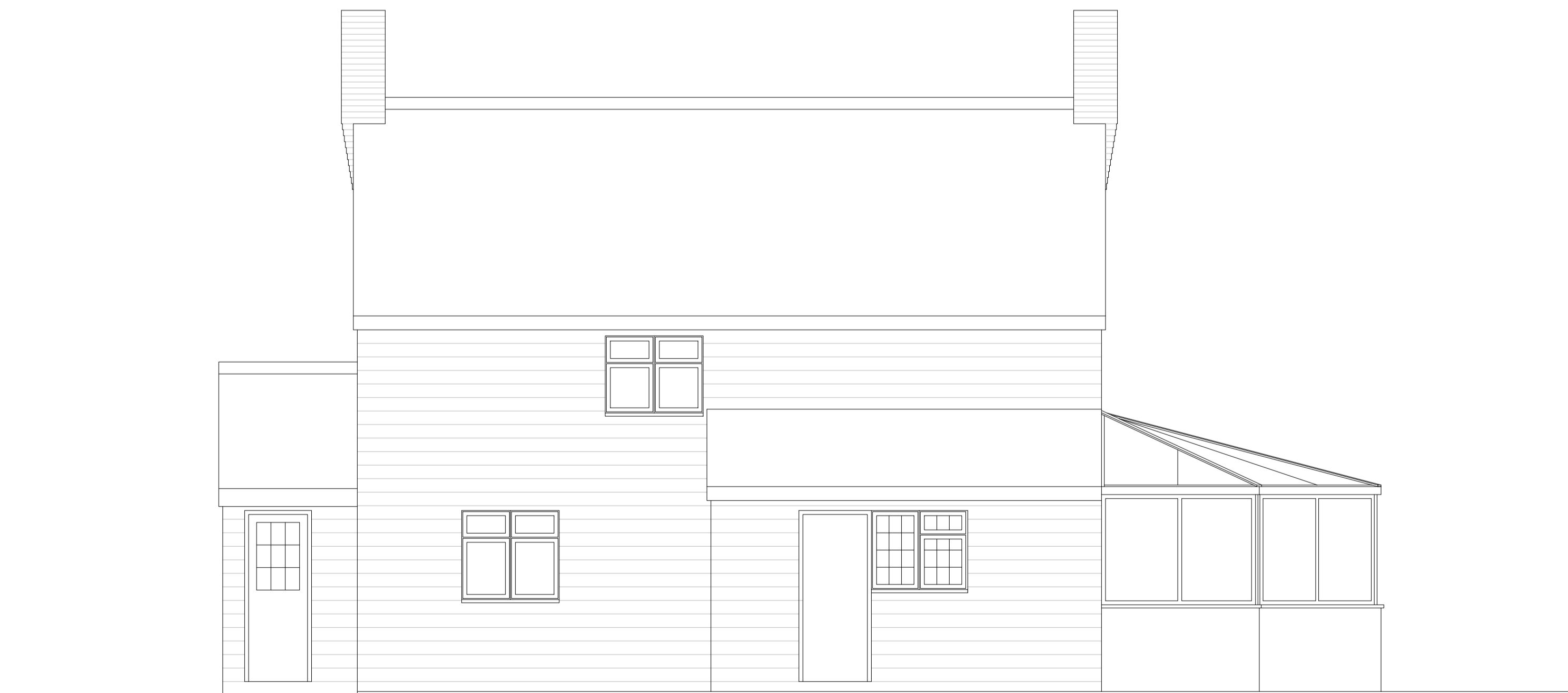
REAR ELEVATION (NORTH)