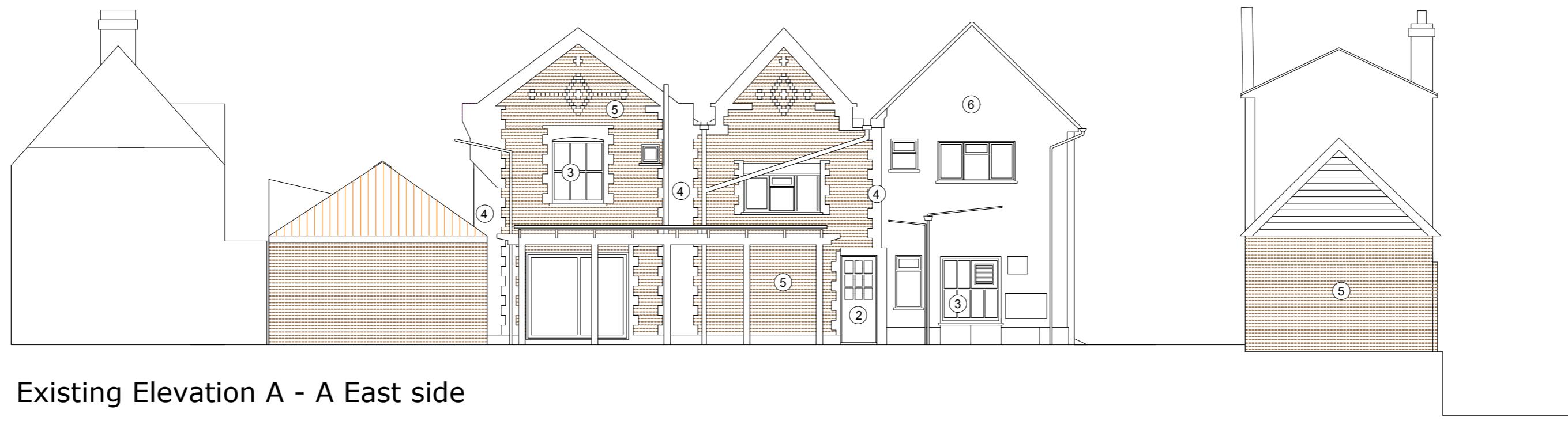
Existing Elevation A - A East side

No deviation from this drawing will be permitted without the express permission of 20 Gainsborough Ltd via the Supervising Officer All works are to comply with the current edition of the Building Regulations and British Standards Construction Design and Management Regulations 2015, Risk Assessment M & E standards to be CIBSE, BAFE, NICEIC, Gas safe Dampers to be fitted to ducting where required Fire stopping to be fitted where required Luminaires to be fire rated where ceiling provide fire separation Fire Officer testing and certification required