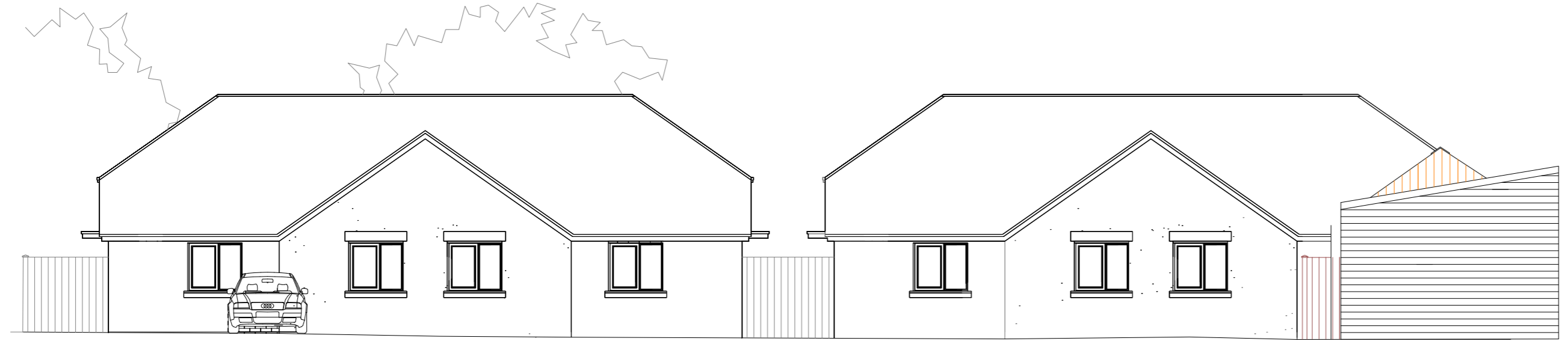
Existing Elevation B - B West side