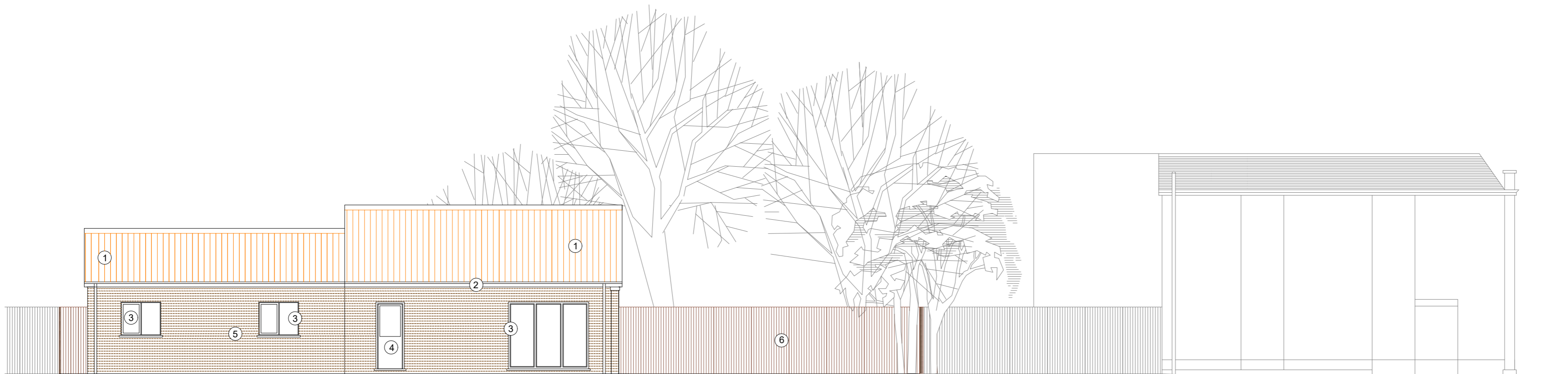
Proposed Elevation C - C South side