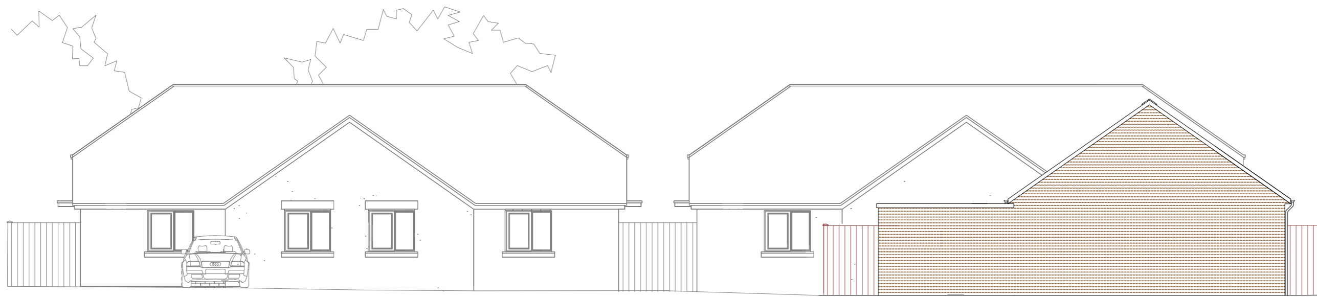
Proposed Elevation B - B West side