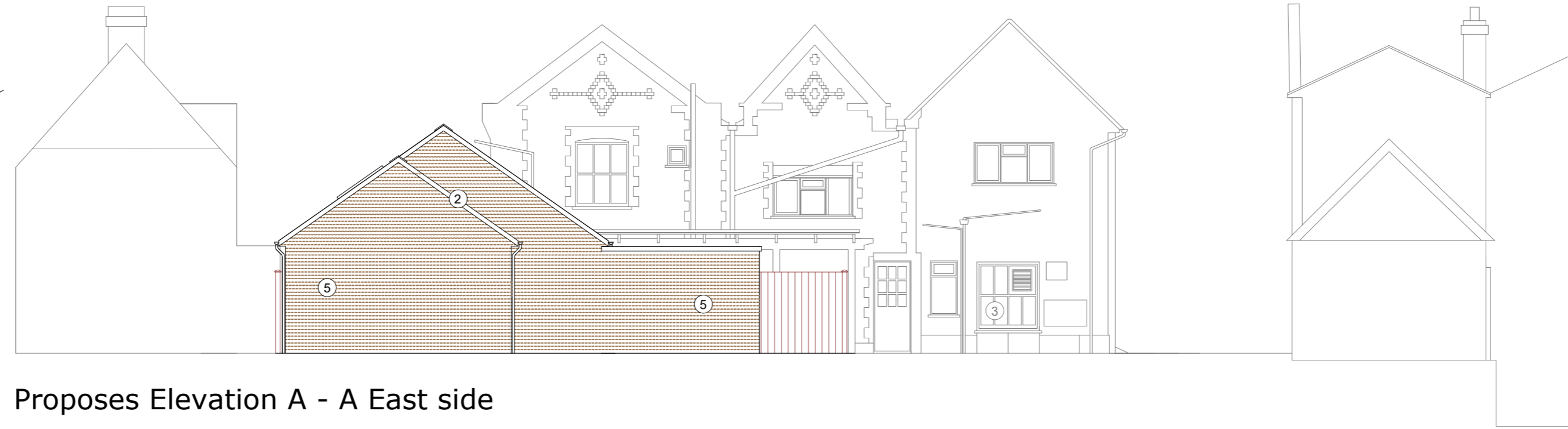
Proposes Elevation A - A East side