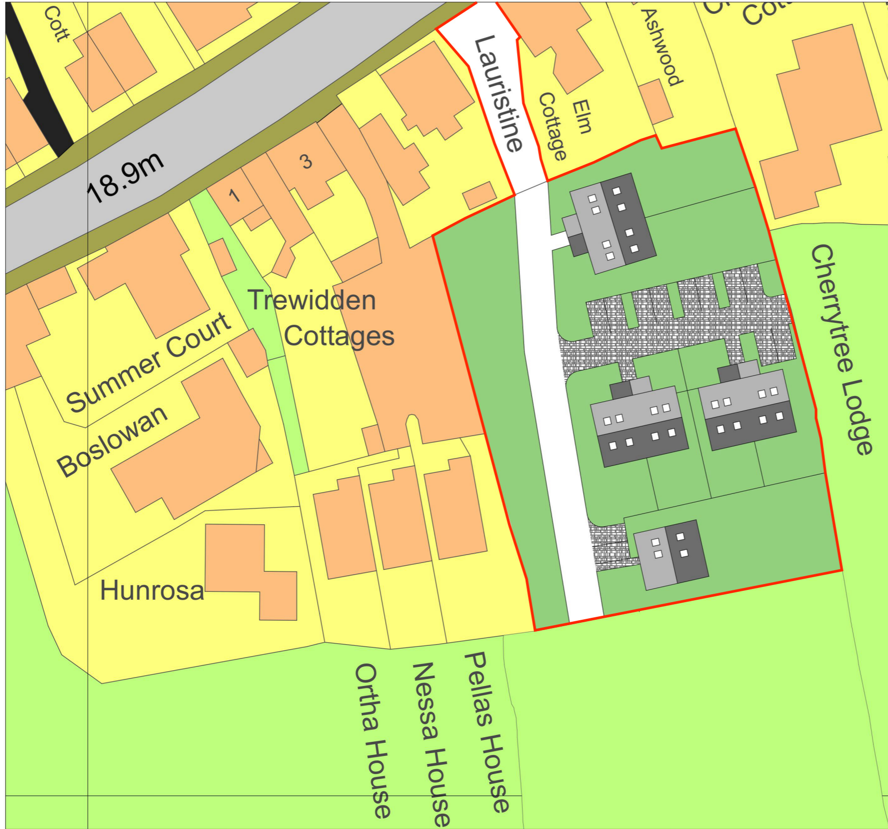
Proposed Site Plan 1:500