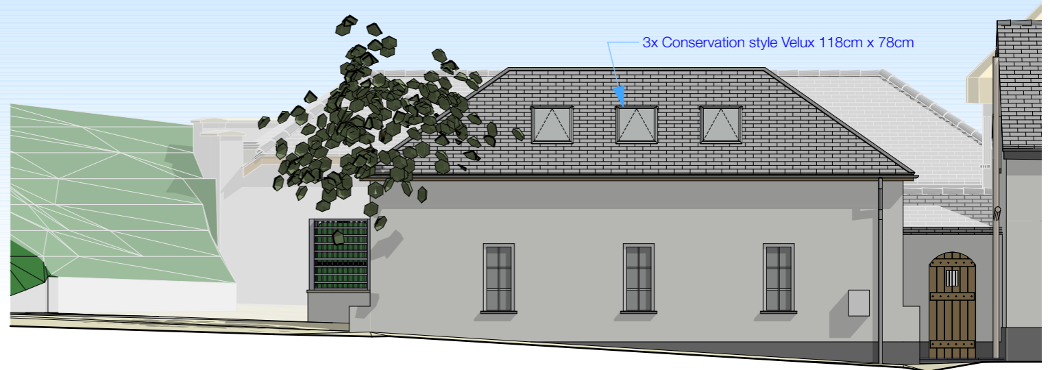
E-04 South Elevation Proposed 1:100