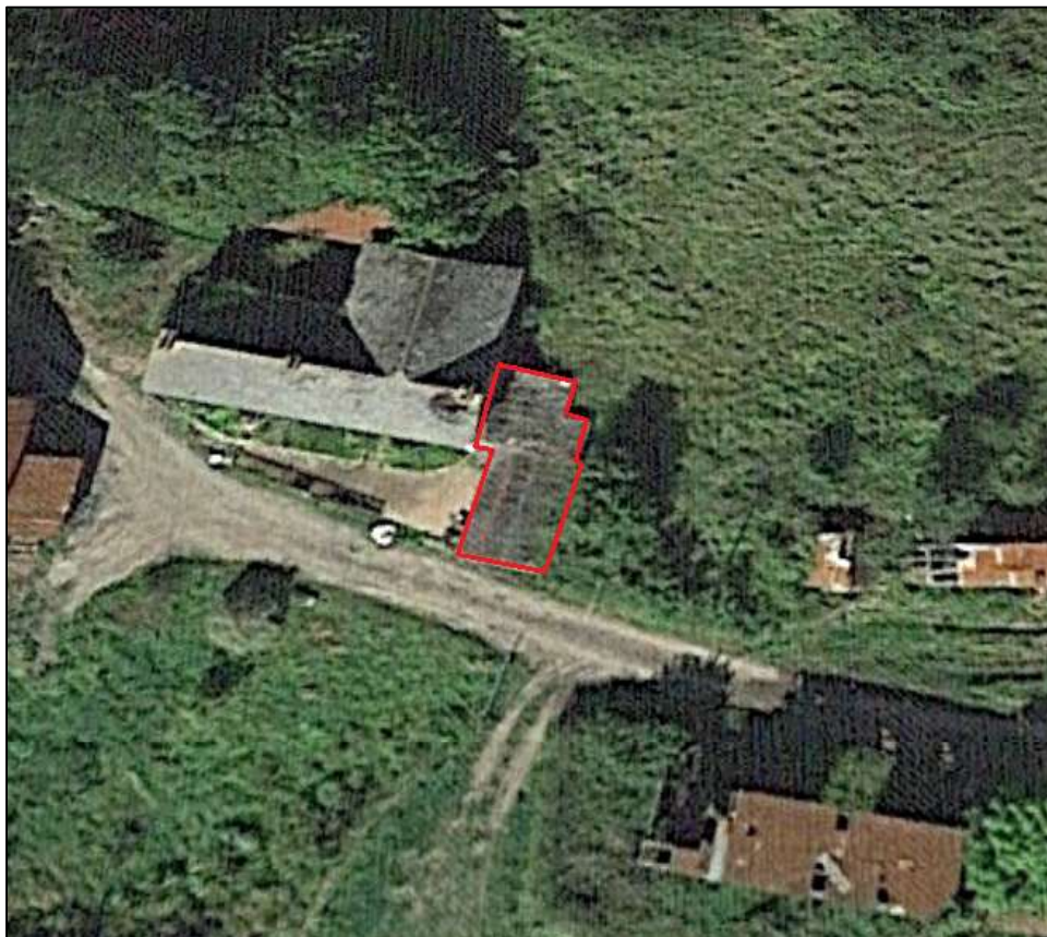
Figure 1. Location of the outbuilding.

SWE was commissioned by P. Ritchie to undertake an ecological assessment of an outbuilding at North Hayne Farm, Shillingford, Devon, EX16 9BJ (Ordnance Survey grid reference ST001239 – see Figure 1). The survey was required to support a replacement application. The Devon Wildlife Checklist is appended to this report.