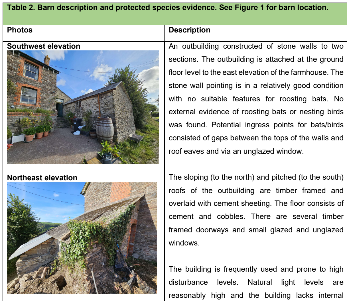
Table 2. Barn description and protected species evidence. See Figure 1 for barn location.

The details of the PRA are provided in Table 2.