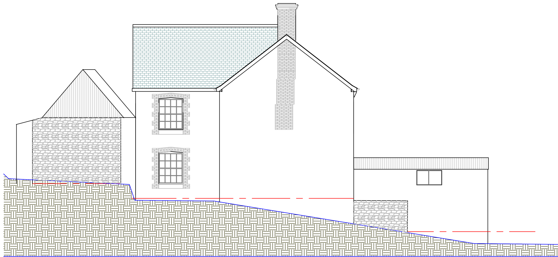
West Elevation 1:100