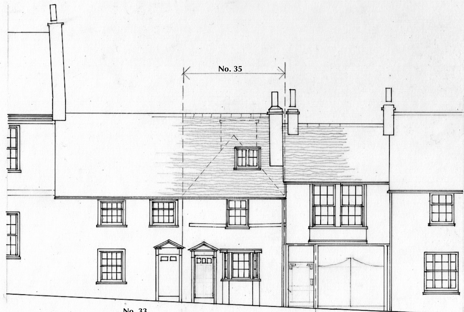
EAST ELEVATION to street