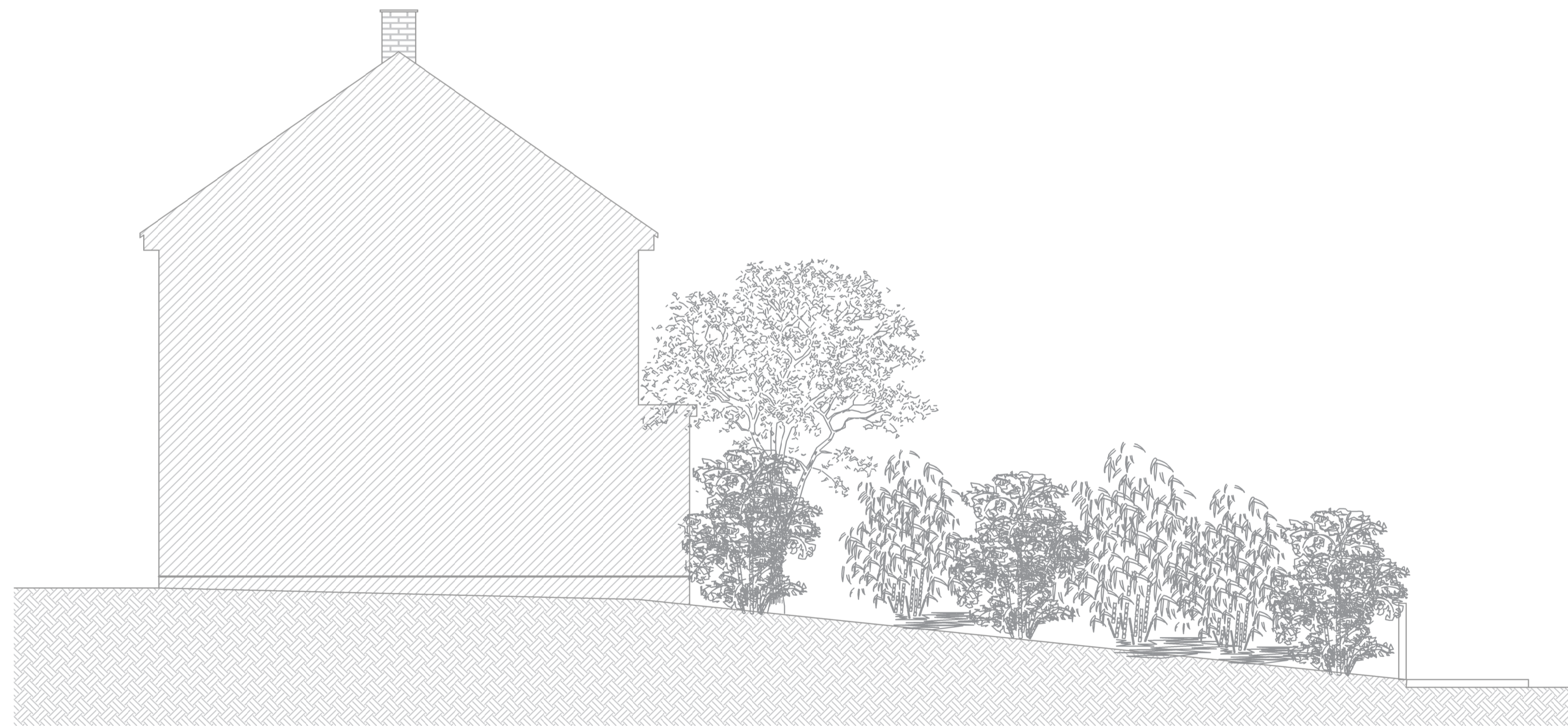
Existing Left Elevation @ 1:50