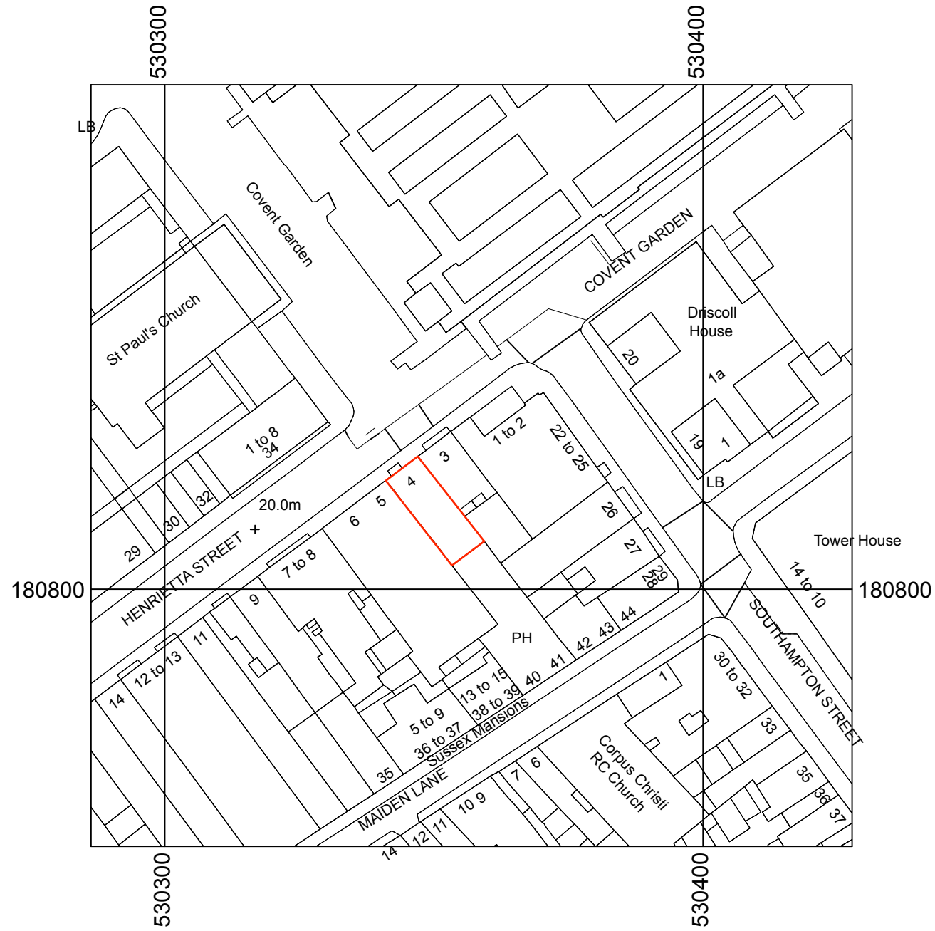
A Site Location Plan