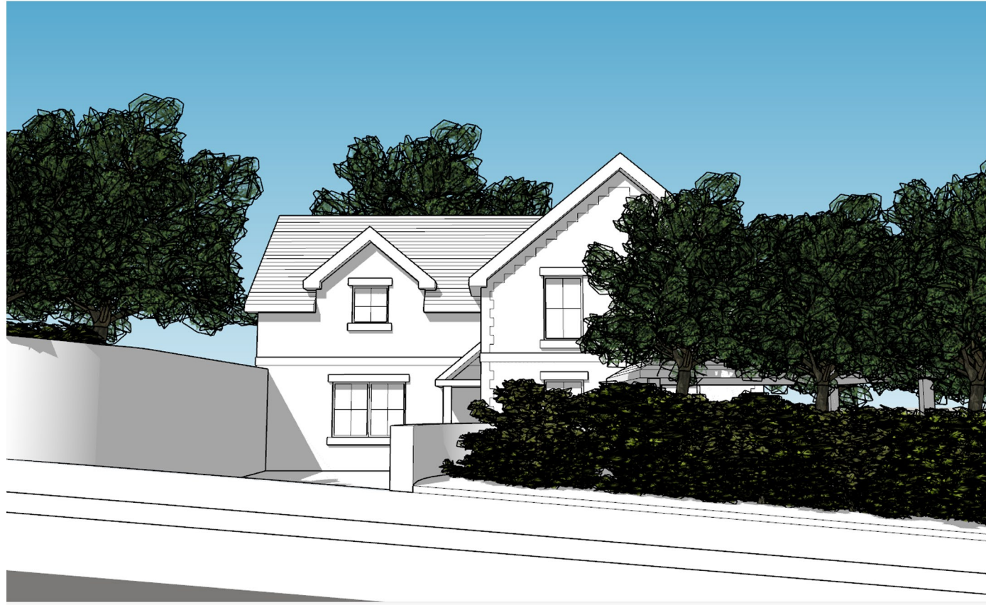
ADDITIONAL INDICATIVE VIEW 1