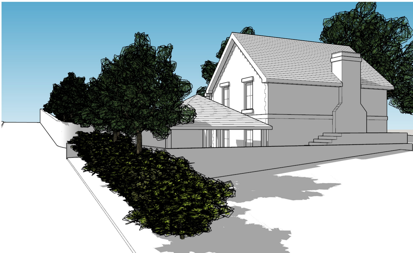
ADDITIONAL INDICATIVE VIEW 3