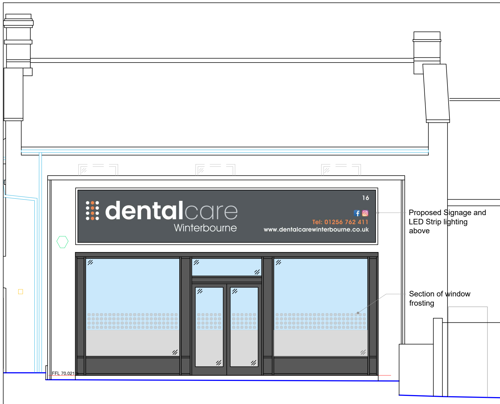
Proposed Signage Elevation Scale 1:50 @ A3