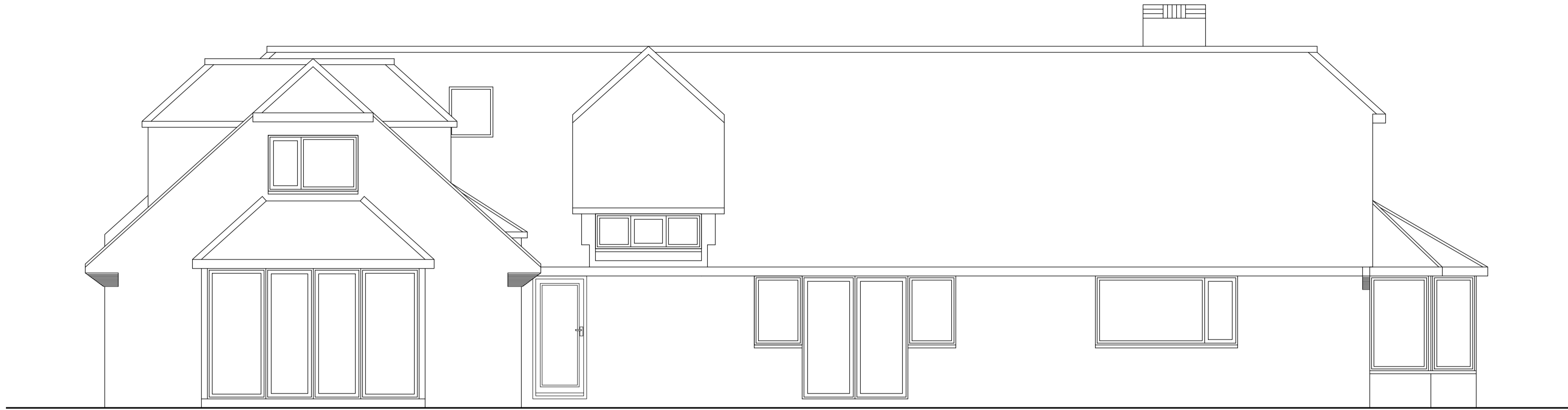
REAR ELEVATION (west facing)