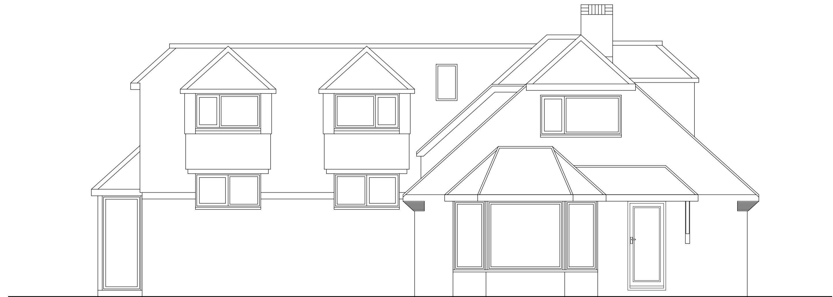
SIDE ELEVATION (south facing)