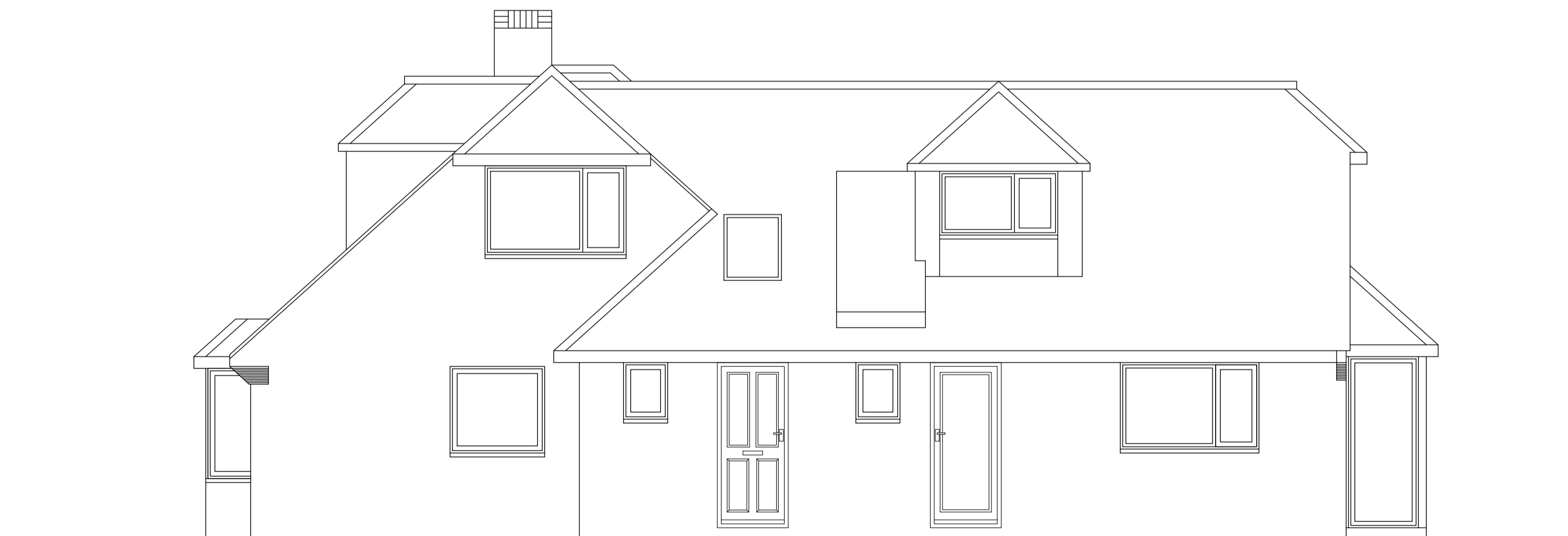
SIDE ELEVATION (north facing)