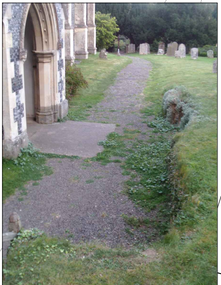
Fig 3. View looking east from south porch