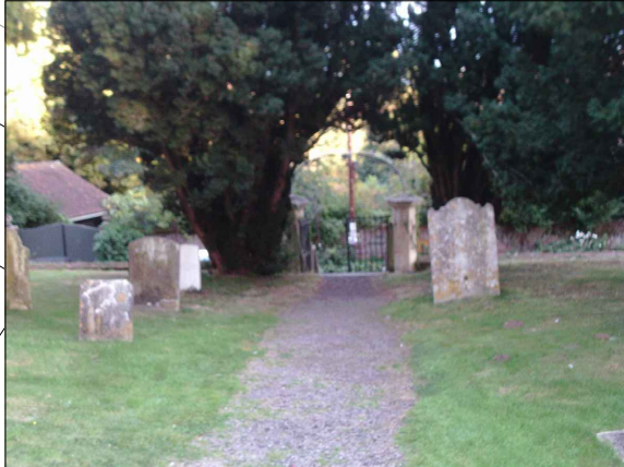
Fig 1. View of path looking towards eastern steps

Laying generally Preparation: Remove all loose material, rubbish and standing water. Adjacent work: Form neat junctions. Do not damage. New paving Keep traffic free until it has cooled to prevailing atmospheric temperature. Do not allow rollers to stand at any time. Prevent damage. Lines and levels: With regular falls to prevent ponding. Overall texture: Smooth, even and free from dragging, tearing or segregation. Condition on completion: Clean. Levels Permissible deviation from the required levels, falls and cambers (maximum): In accordance with BS 5949:87, clause 5.2.