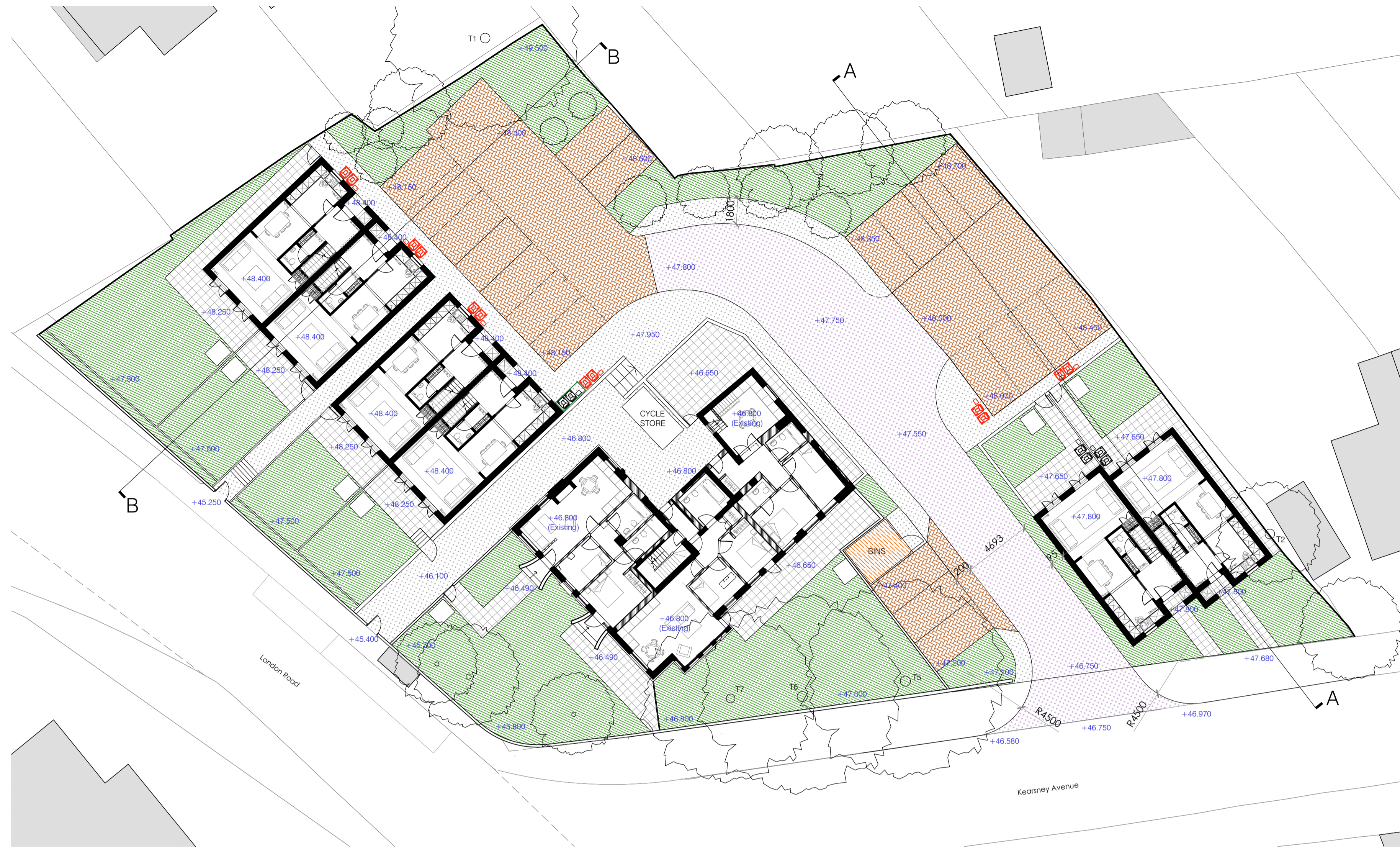
Proposed Block Plan 1:200 2 0 2 4 6 8 10 12 14 16 18 20 22 metres

NOTES: - Do Not Scale - The Contractor is responsible for checking all dimensions, tolerances and references. All discrepancies must be reported to Stour Valley Architecture before works proceed. - Where an item is covered by drawings to different scales, the larger scaled drawing is to be worked to. COPYRIGHT: Stour Valley Architecture own the copyright to this drawing. Their written consent must be obtained before this drawing is copied or used for any purpose other than the one in which it was supplied.