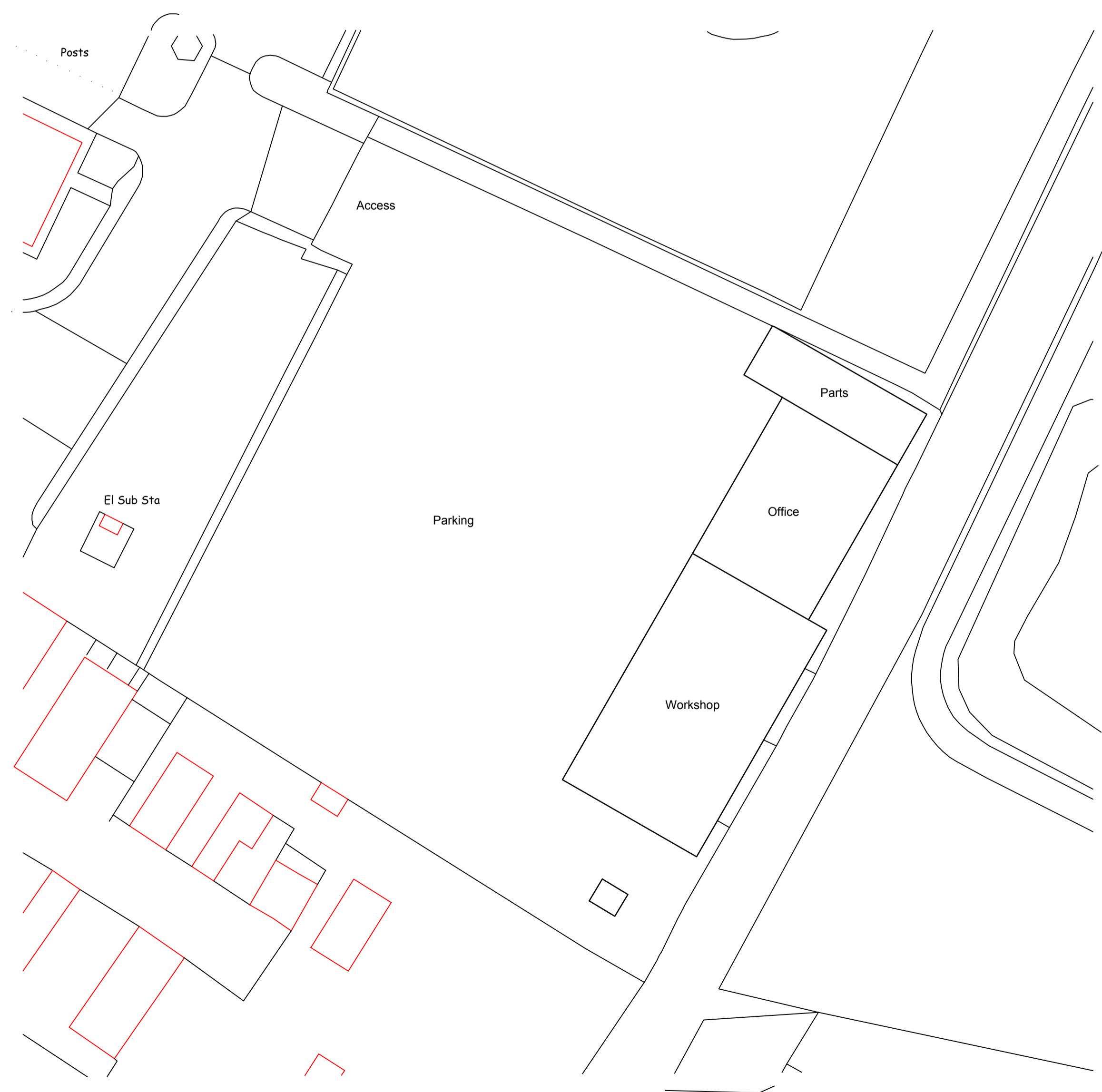
Existing Block Plan