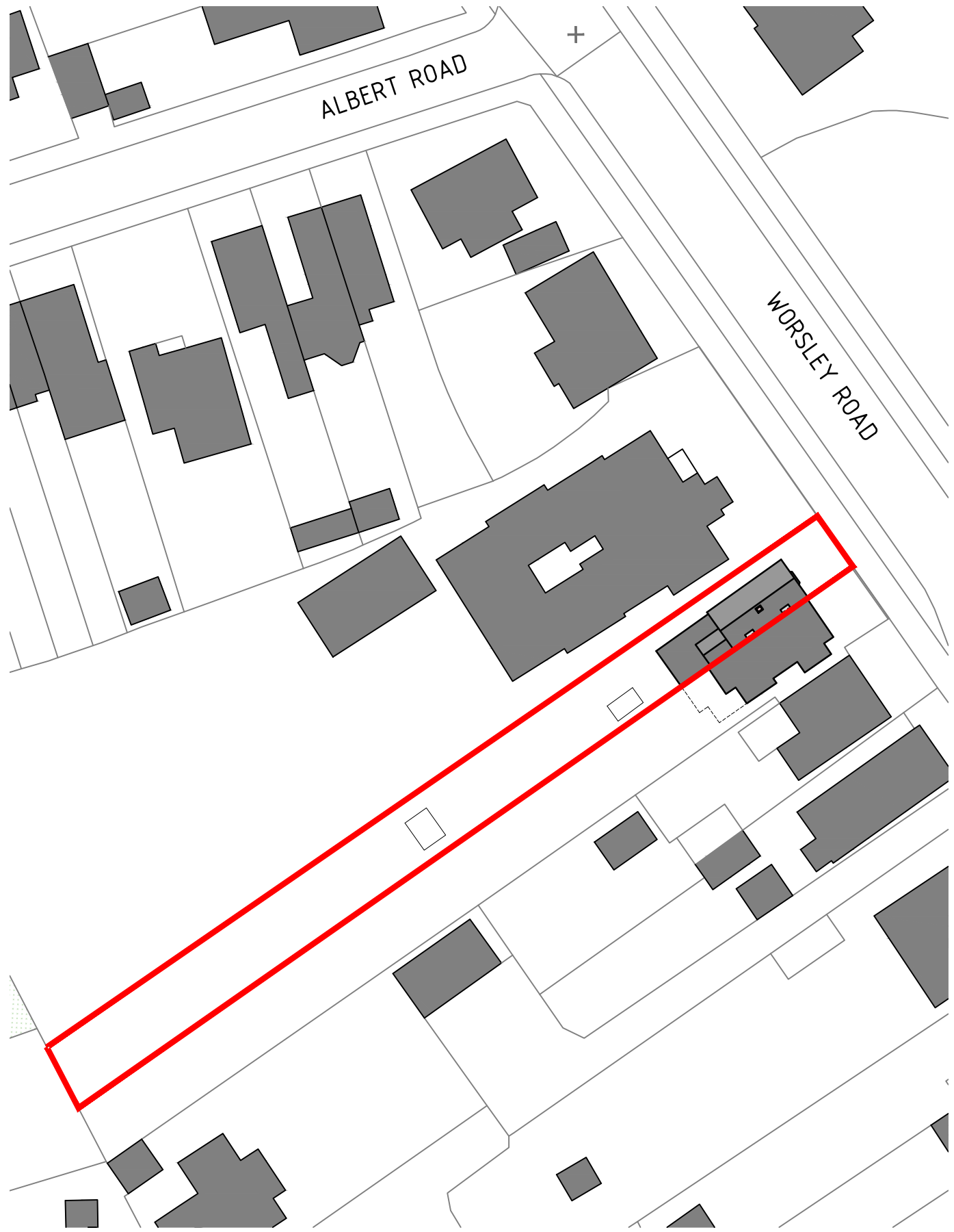
N EXISTING SITE LOCATION PLAN SCALE 1:500 @ A3 0 5 10 15 20 25 METRES