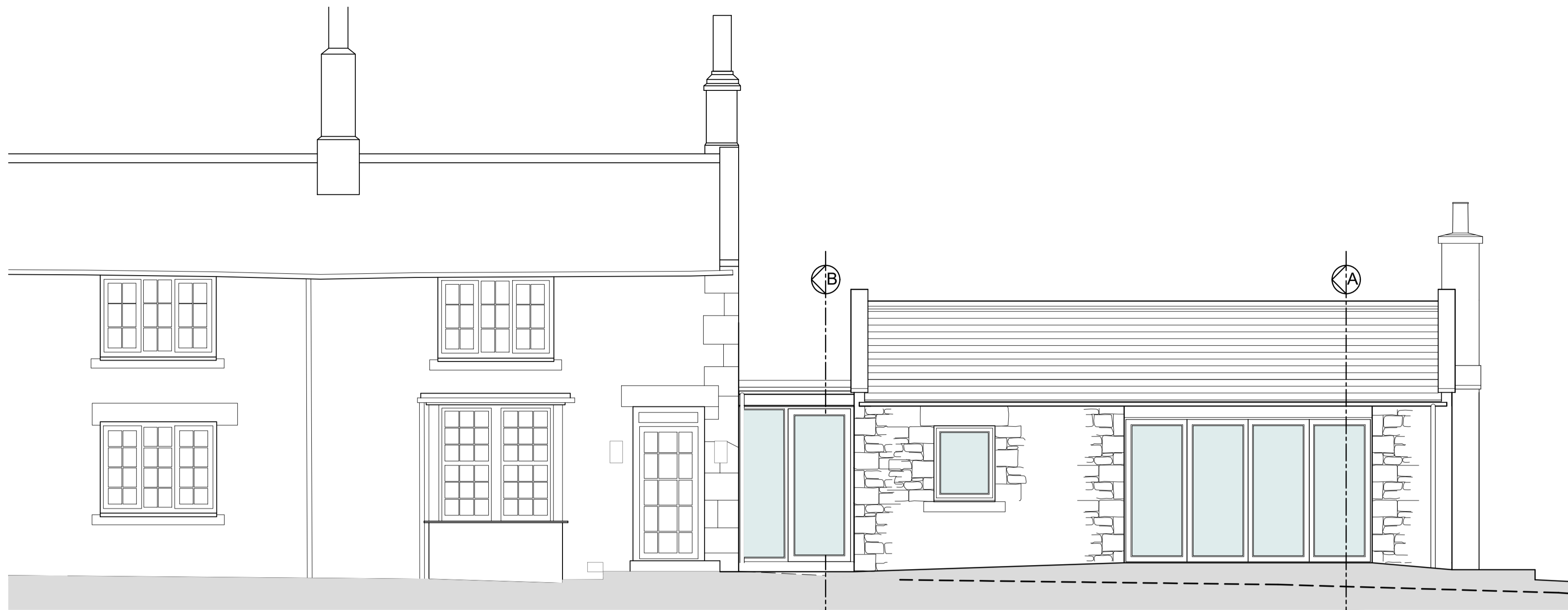
PROPOSED SOUTH (FRONT) ELEVATION 1:50

External - Paving to be stone flag stones