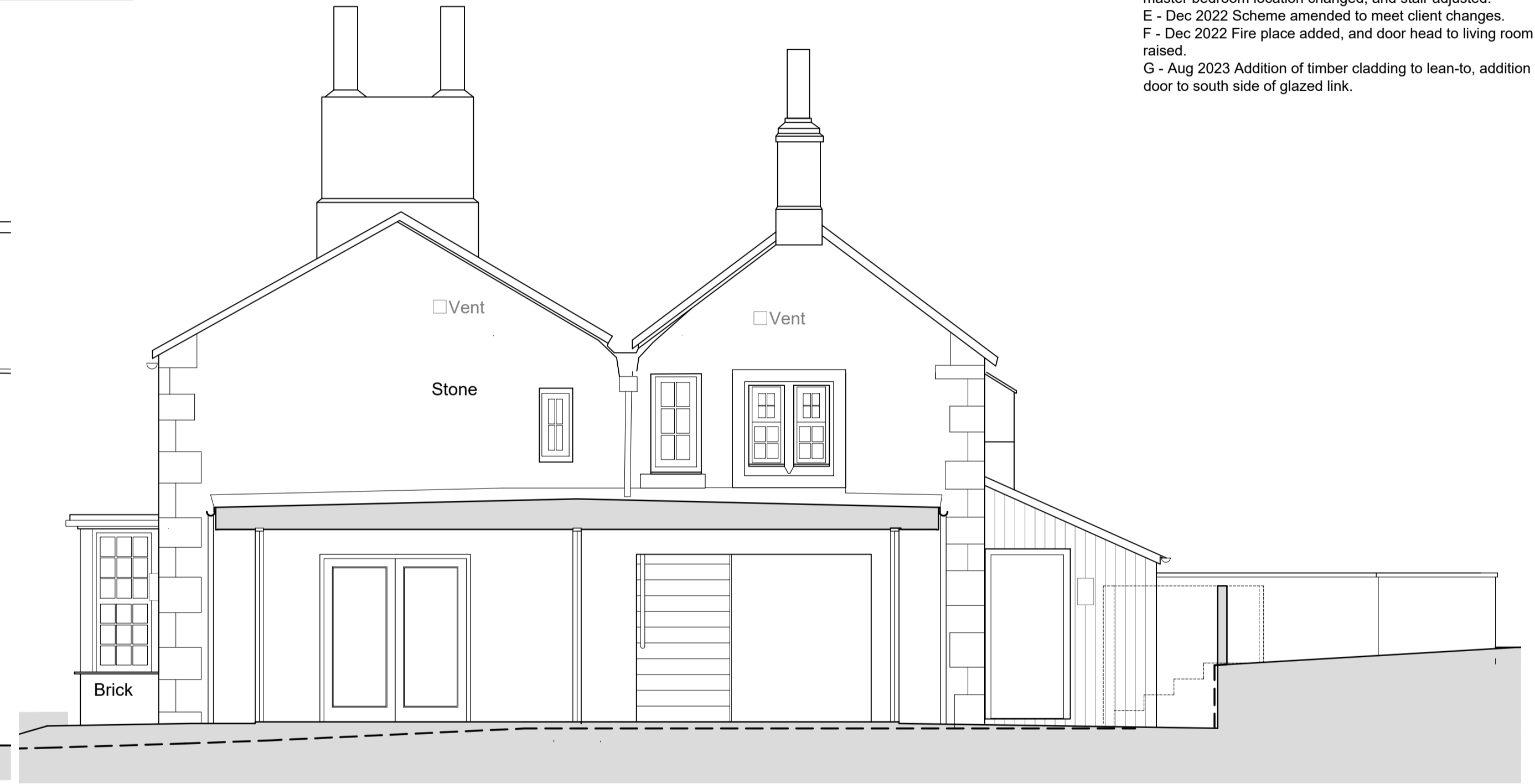
PROPOSED SECTION B_B 1:50