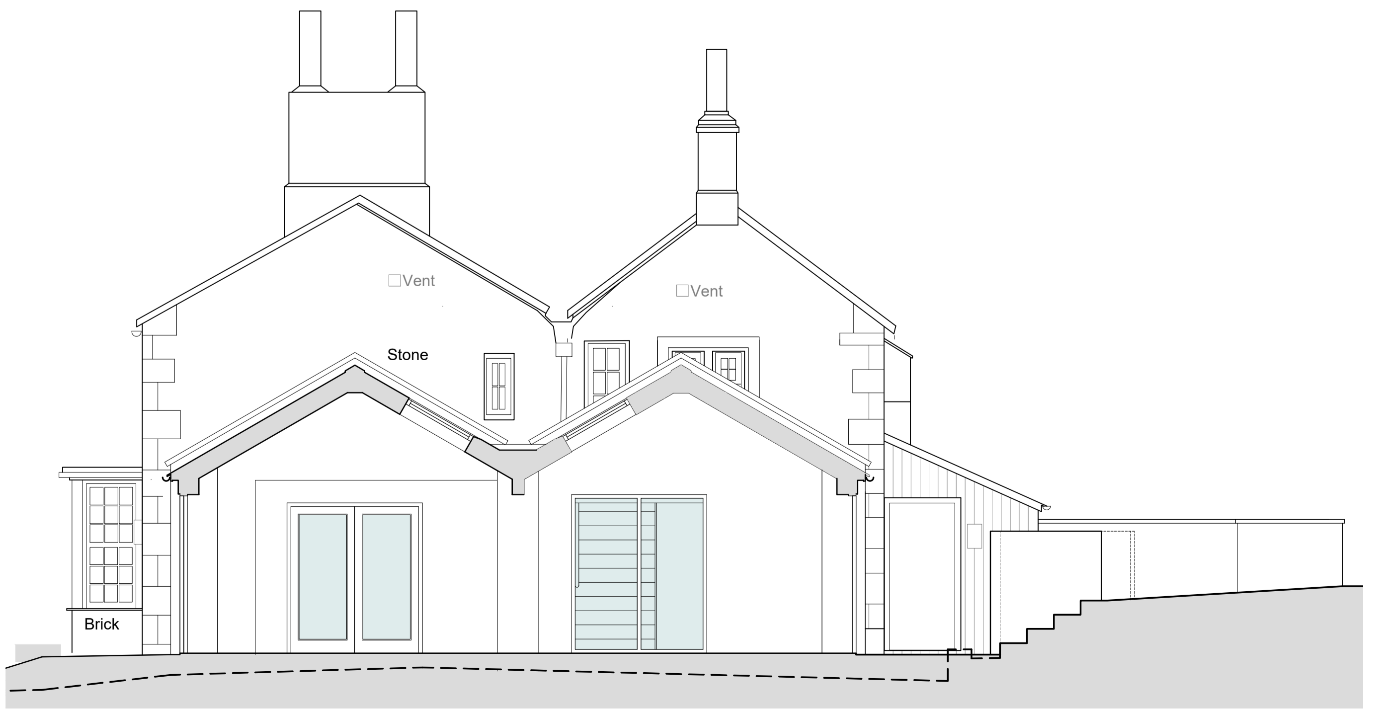
PROPOSED SECTION A_A 1:50