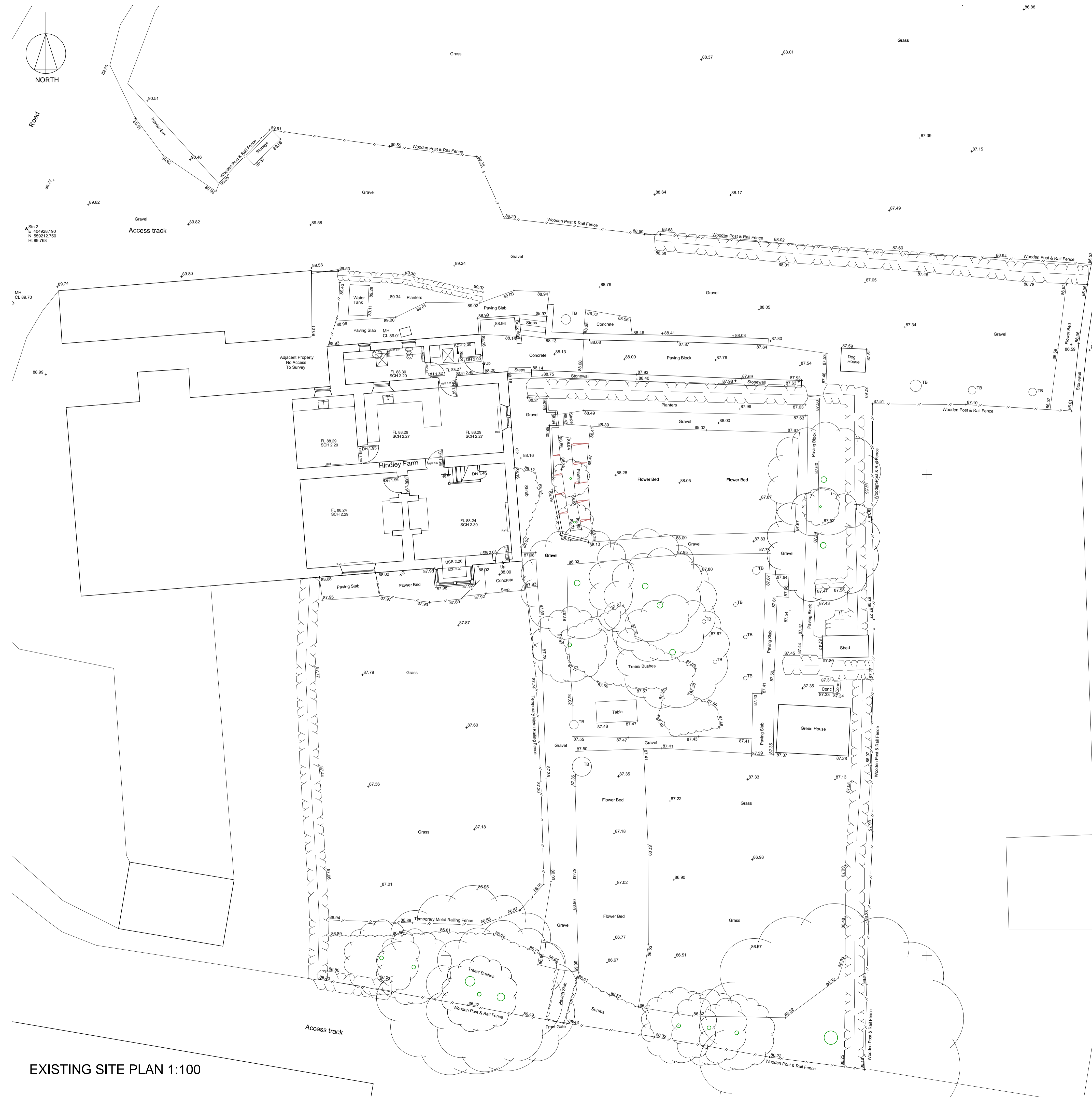
EXISTING SITE PLAN 1:100

A - Feb 2022 Additional site information added