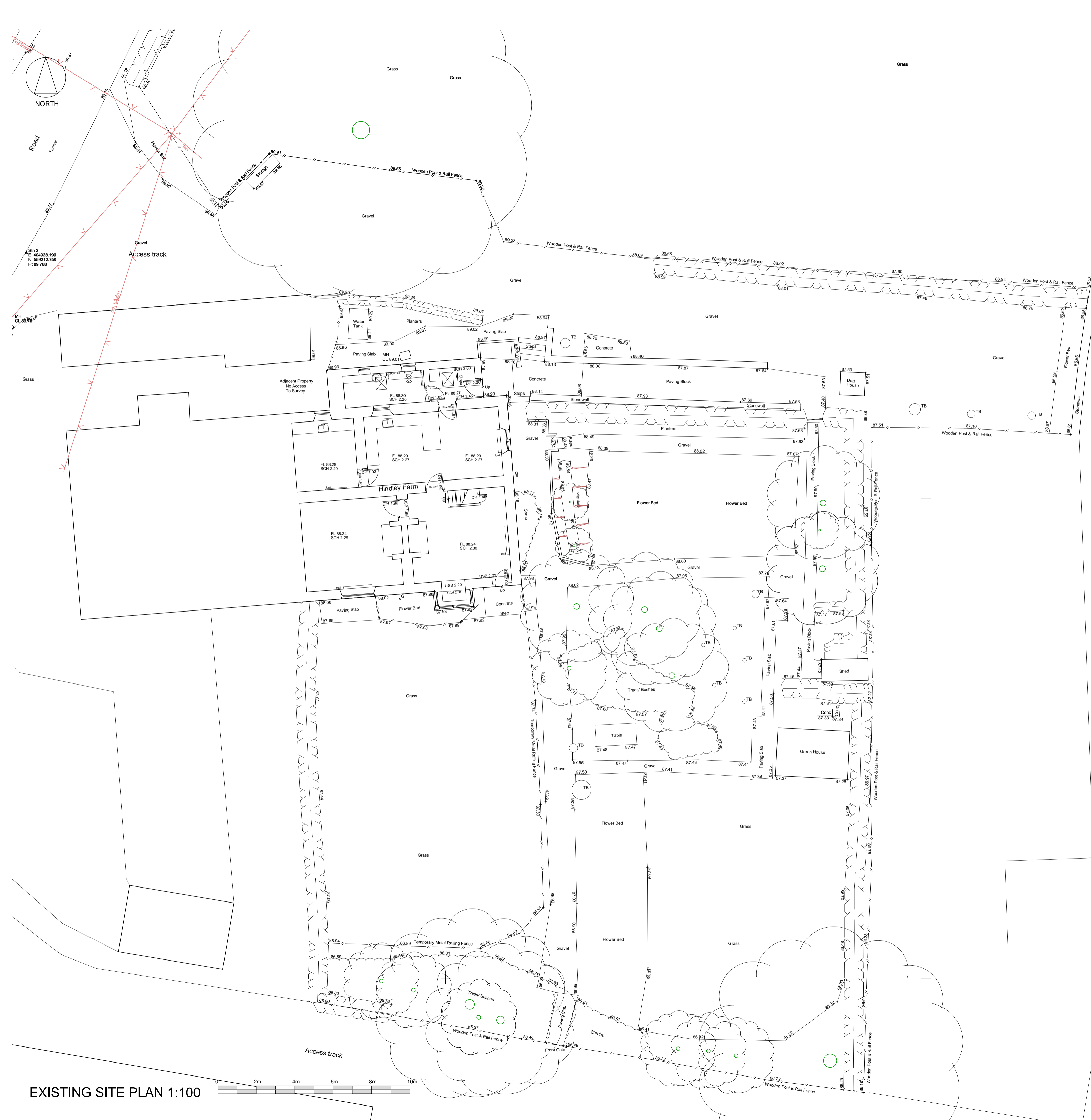
EXISTING SITE PLAN 1:100