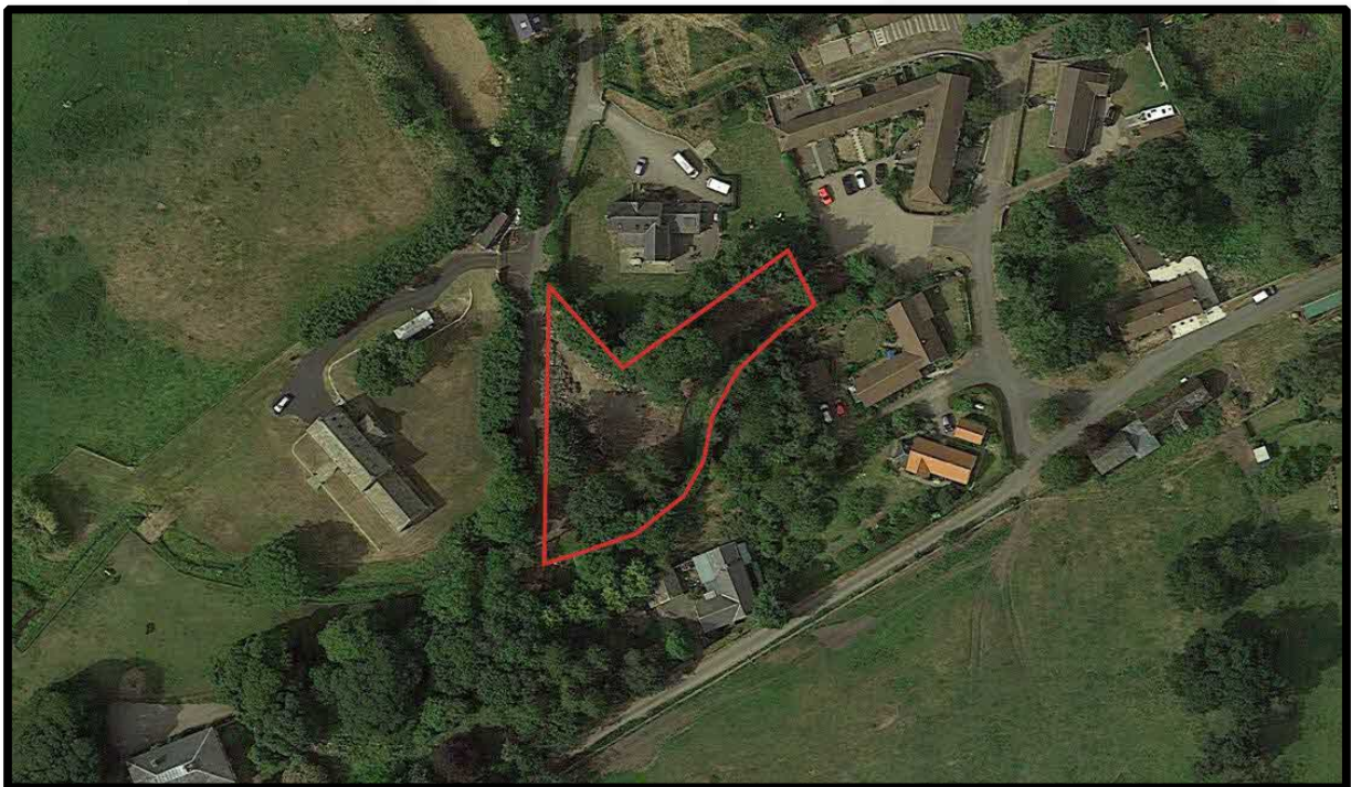
Figure 1: Aerial Image of site with approximate red line boundary.

Subsequently, this report has been produced, balancing the layout of the proposed development against the competing needs of trees. This report comprises all of the requisite elements of an arboricultural implications assessment, method statement and supporting plans.