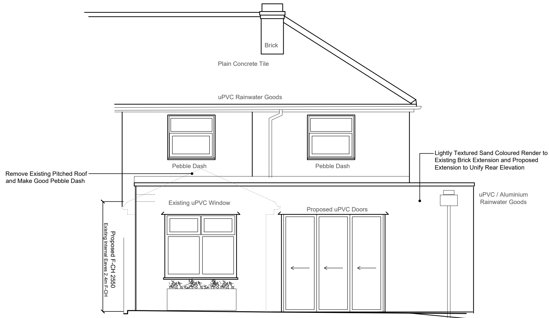
Rear Elevation (North)