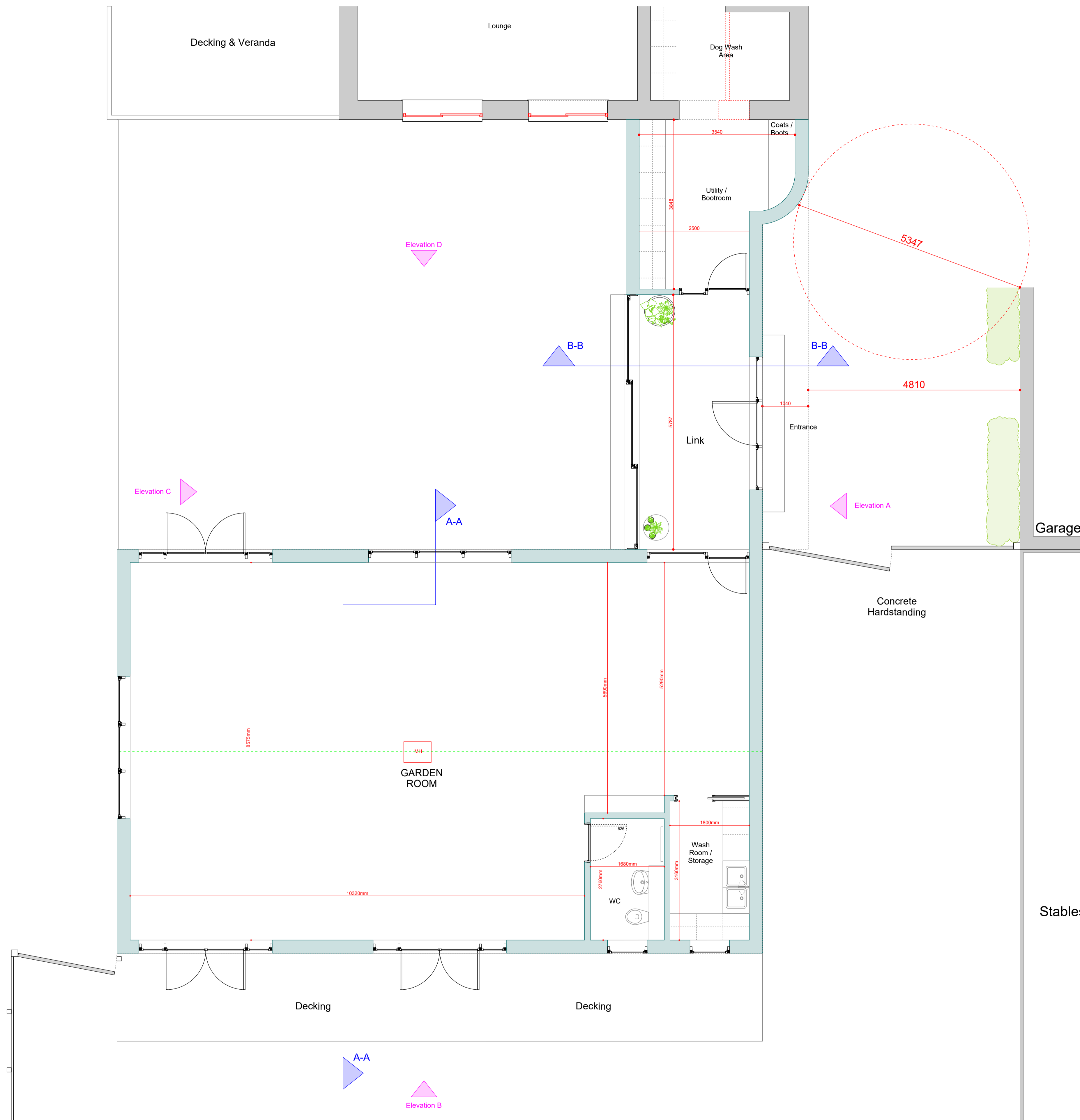
Proposed Ground Floor @ 1:50