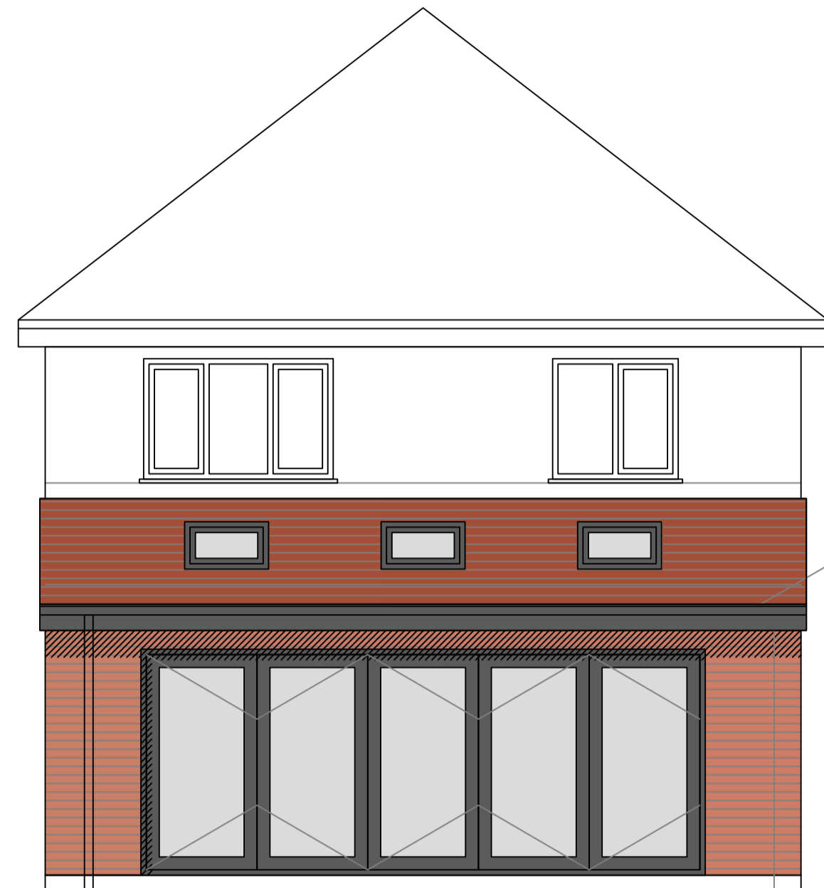
PROPOSED REAR 1:50 @ A1