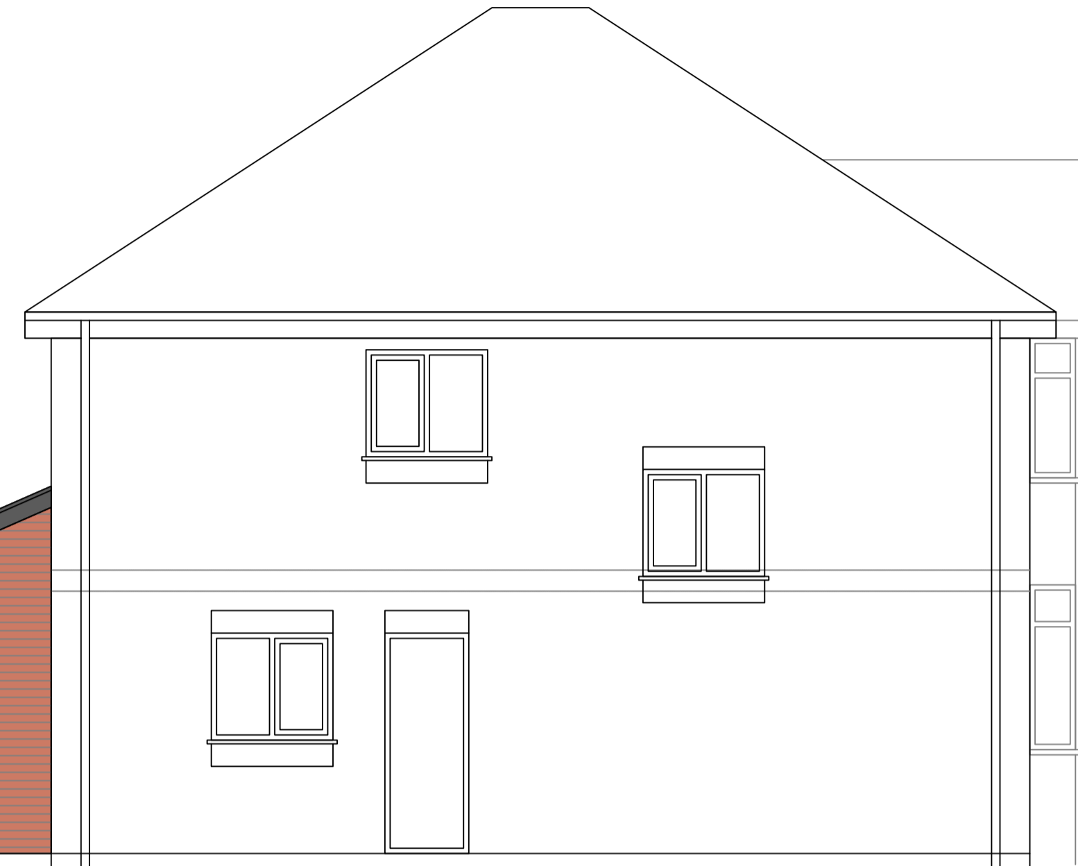
PROPOSED SIDE 1:50 @ A1