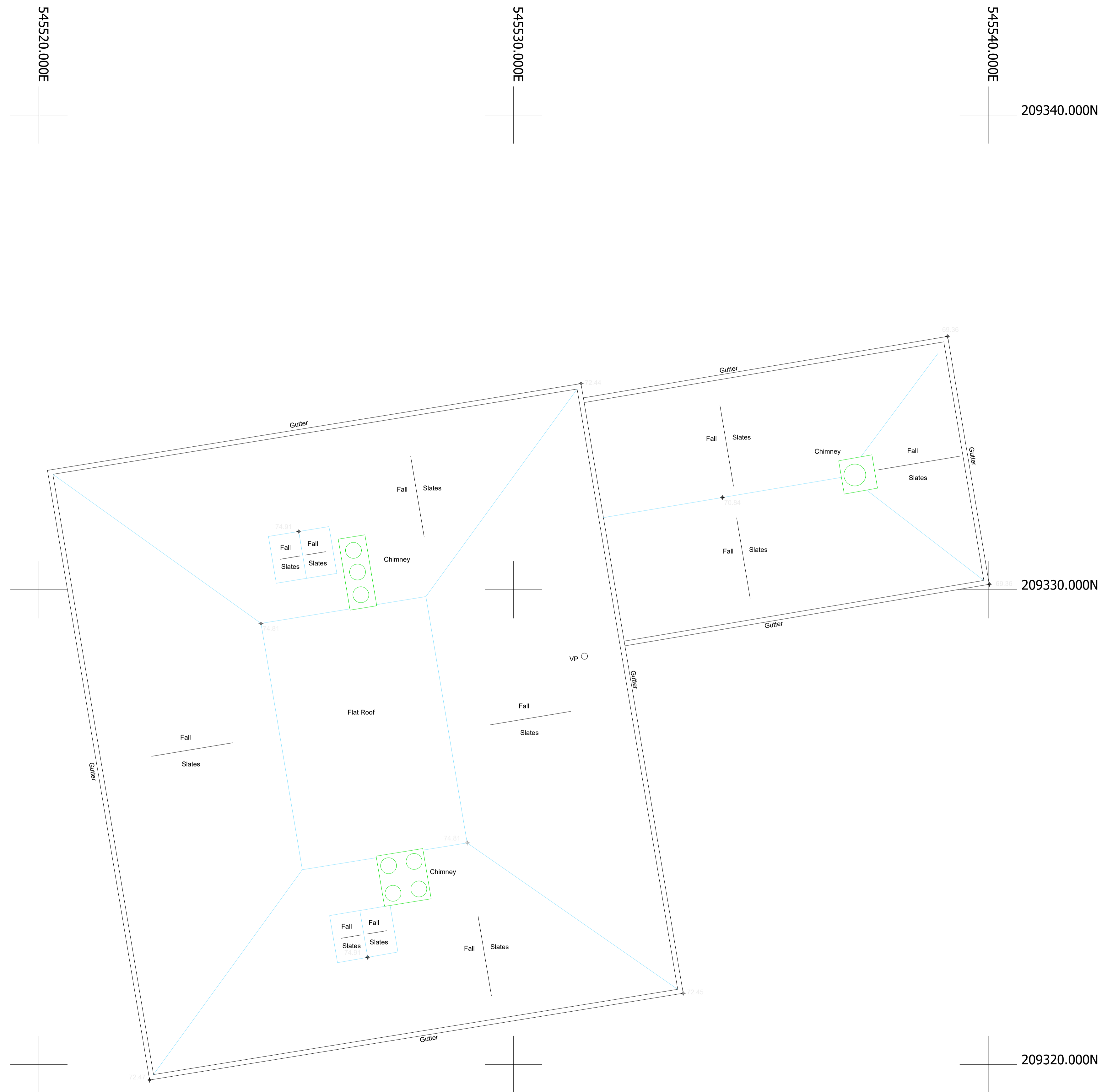
EXISTING ROOF PLAN Scale 1:50

THIS DRAWING IS TO BE READ IN CONJUNCTION WITH ALL RELEVANT STRUCTURAL ENGINEERS AND MECHANICAL AND ELECTRICAL ENGINEERS DRAWINGS, DETAILS AND SPECIFICATIONS.