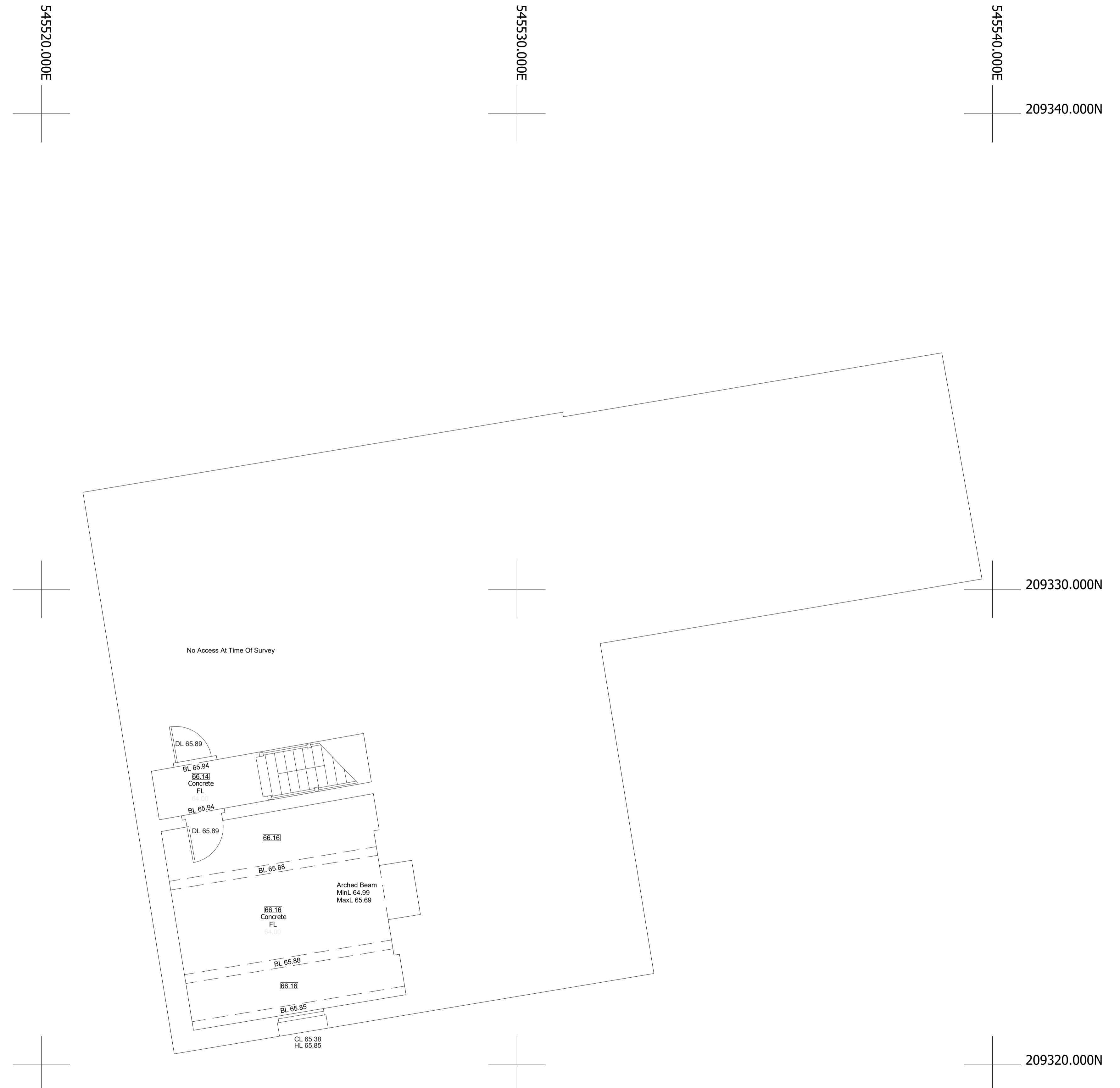
EXISTING BASEMENT PLAN Scale 1:50

THIS DRAWING IS TO BE READ IN CONJUNCTION WITH ALL RELEVANT STRUCTURAL ENGINEERS AND MECHANICAL AND ELECTRICAL ENGINEERS DRAWINGS, DETAILS AND SPECIFICATIONS.