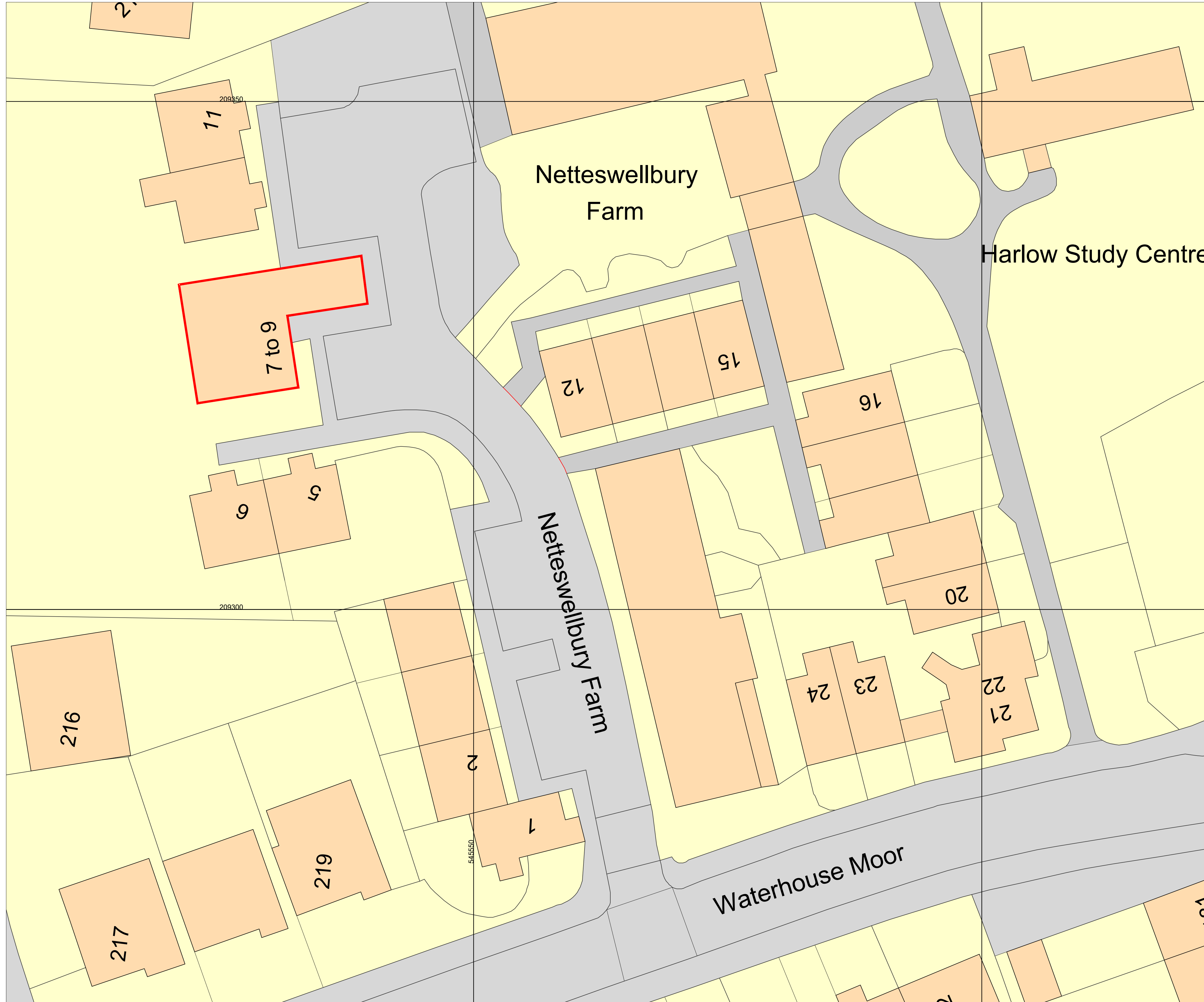
EXISTING Block Plan Scale 1:200