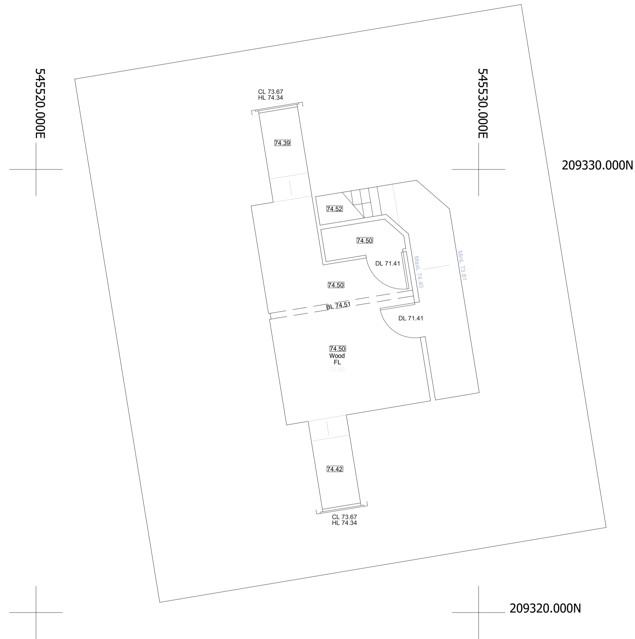
EXISTING SECOND FLOOR PLAN Scale 1:50