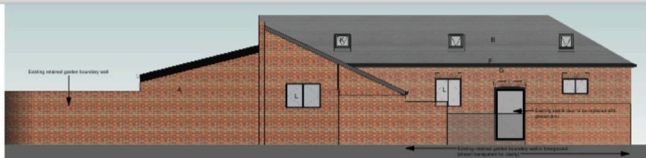
PROPOSED NORTHEAST ELEVATION