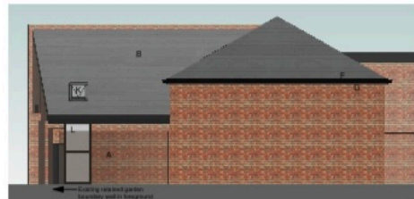
PROPOSED NORTHWEST ELEVATION