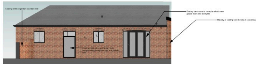
PROPOSED SOUTHWEST ELEVATION